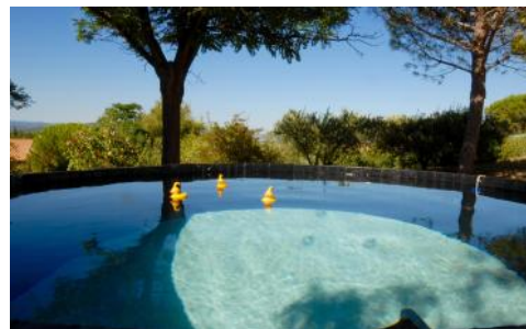
join the ducks