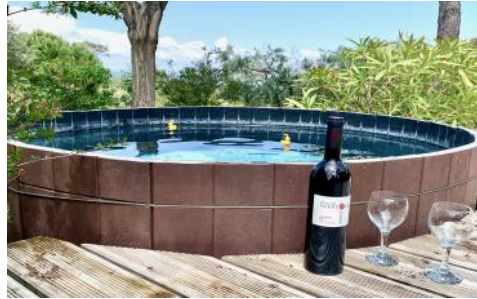
Ready to cool off