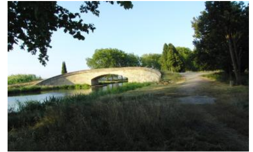
Canal du Midi