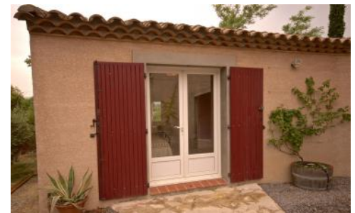
Front entrance and Parking