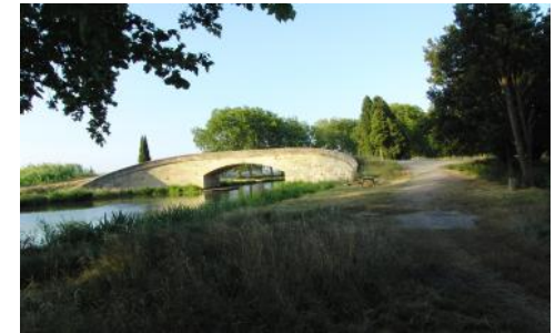
Canal du Midi