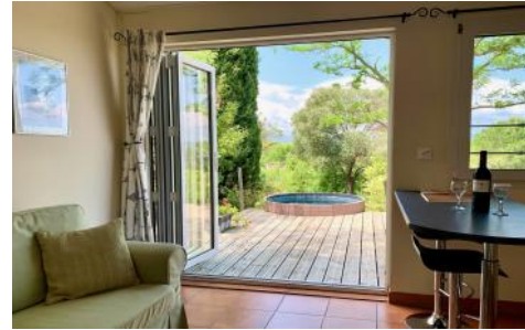
Looking inside out