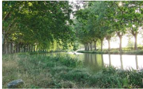
Canal du Midi close by