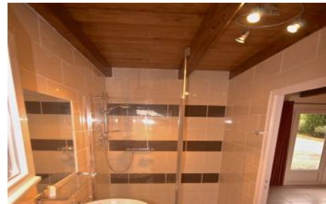
shower with a mountain view