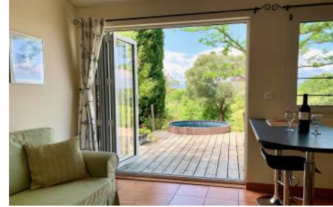
Looking inside out