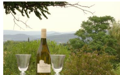
view towards Montagne Noir