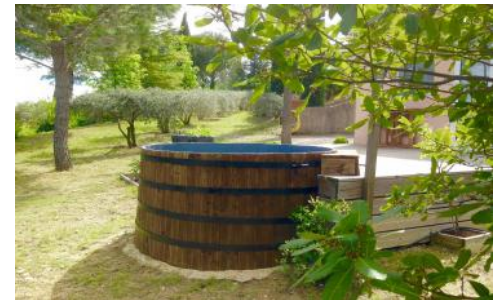
Plunge pool and olive trees