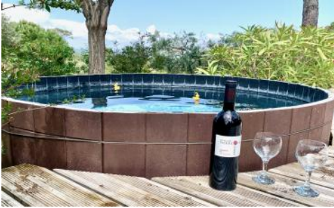
Ready to cool off