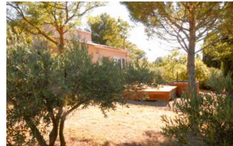
from the Olive trees