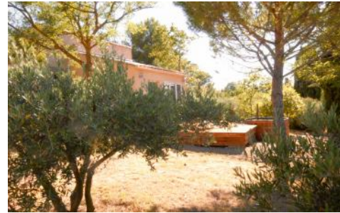
from the Olive trees