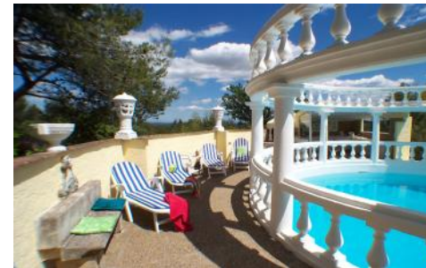
Pool sun terrace