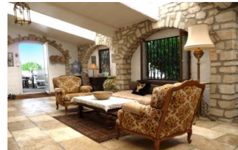
Stone entrance hall towards front door