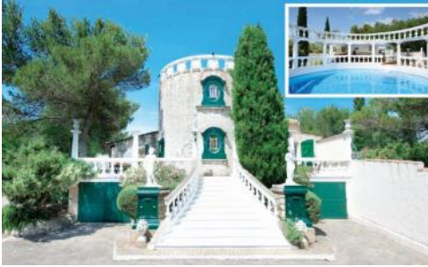
Villa from gates