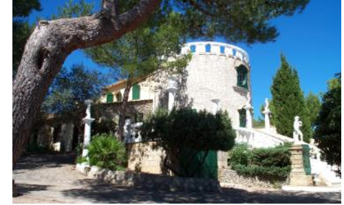
View of villa from pool