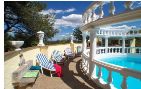
Pool sun terrace