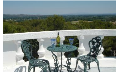
Roof top terrace