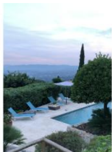
View from Terrace