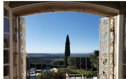
View from Master