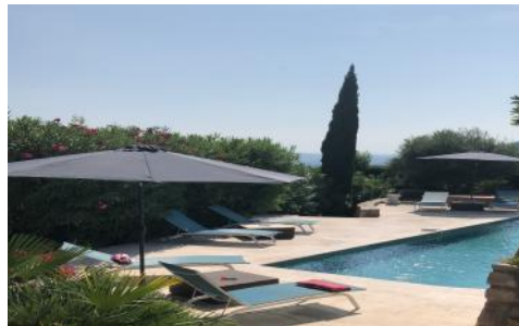
View from terrace