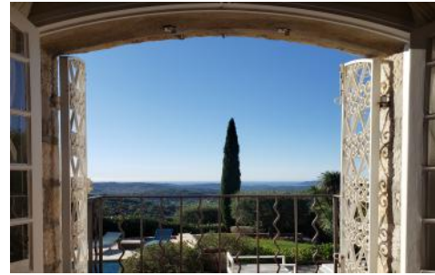
View from Master