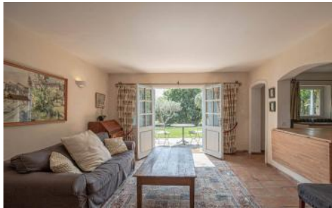
Apartment sitting room