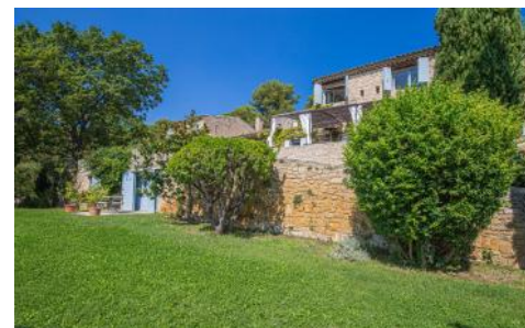
Outside apartment to upstairs