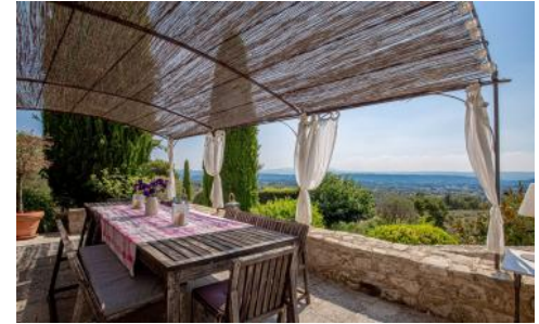
Dining area outside