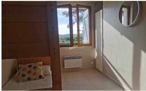
Childrens' bunk bed room