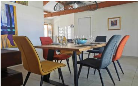
Dining table for 6