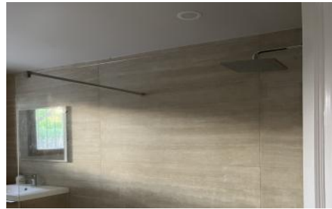
Ensuite bathroom with walk in shower