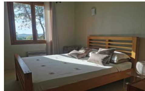
Double bedroom with garden views