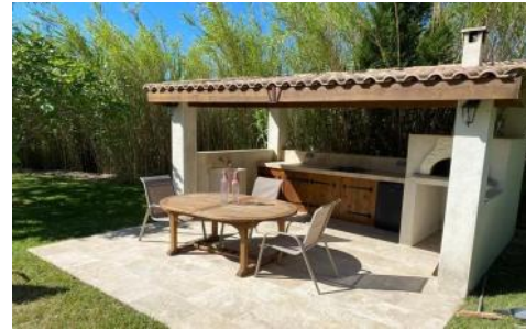
Outdoor kitchen / pizza oven