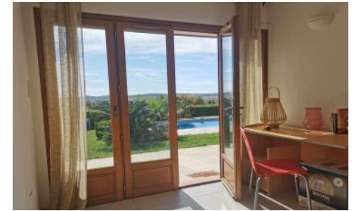
Study with access to garden