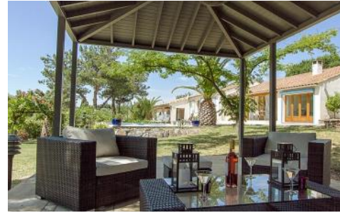
Apéro in the gazebo