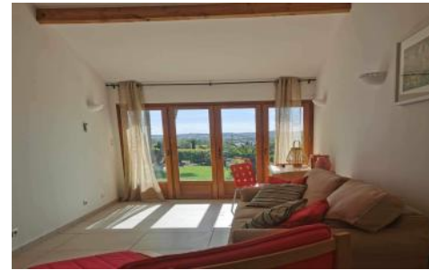
Study with garden views