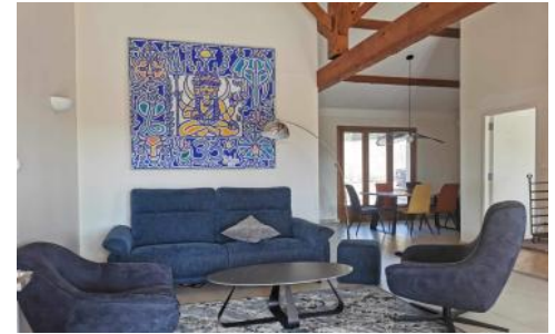
Open plan lounge / dining area