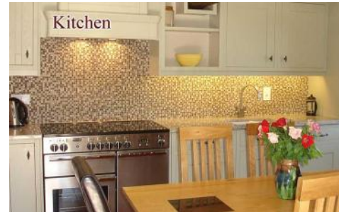
Mas D'en Porte-kitchen