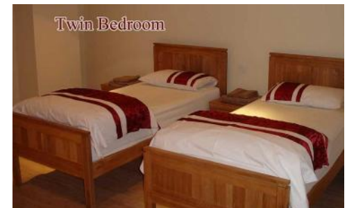
Mas D'en Porte-twin bedroom