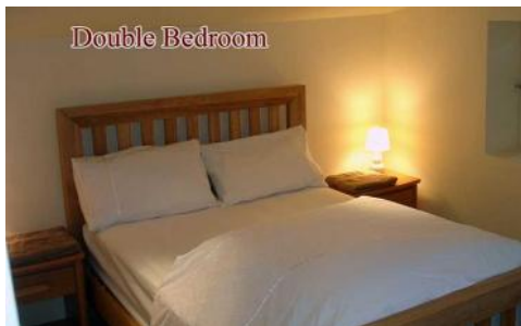
Mas D'en Porte-double bedroom 1