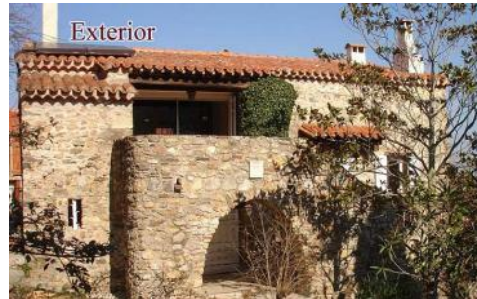
Mas D'en Porte-Exterior