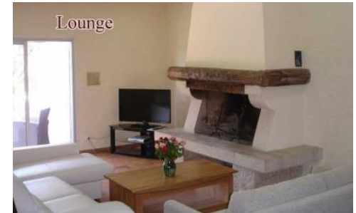
Mas D'en Porte-lounge