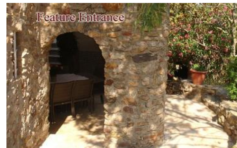
Mas D'en Porte-feature entrance