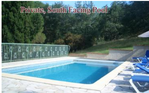
Mas D'en Porte-Pool-facing-South