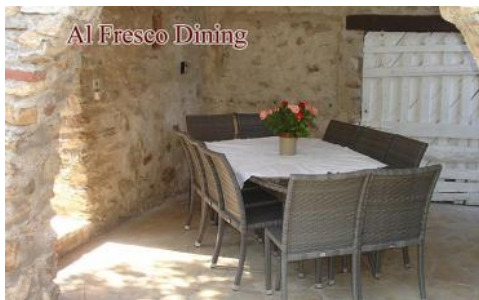
Mas D'en Porte-Exterior-Dining