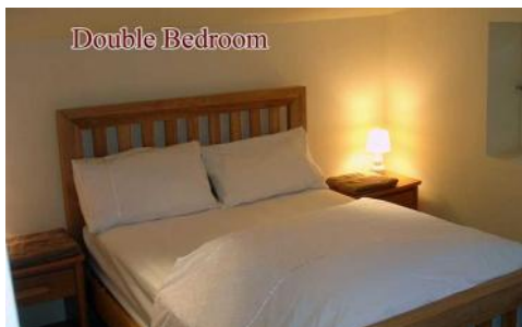
Mas D'en Porte-double bedroom 1