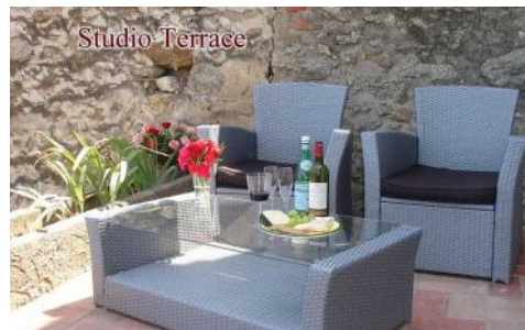
Mas D'en Porte-Studio terrace