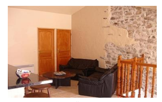
Cottage Des Alberes - TV Lounge