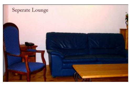
Canigou separate lounge