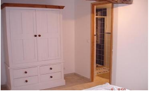
Cottage Des Alberes - Master Bedroom 1