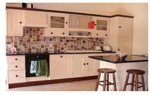
Cottage Des Alberes - Well Equipped Kitchen