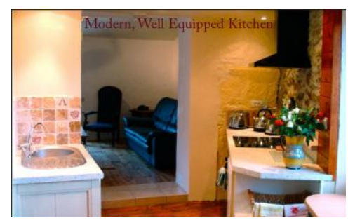
Canigou new fitted kitchen