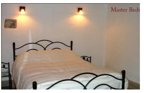
Canigou master bedroom