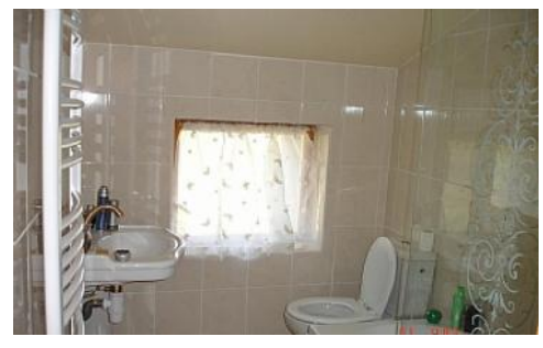
Cottage Des Alberes - Family Bathroom