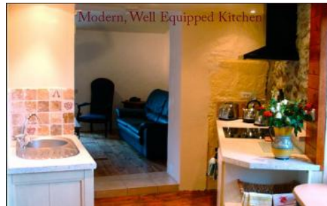
Modern, Well Equipped Kitchen