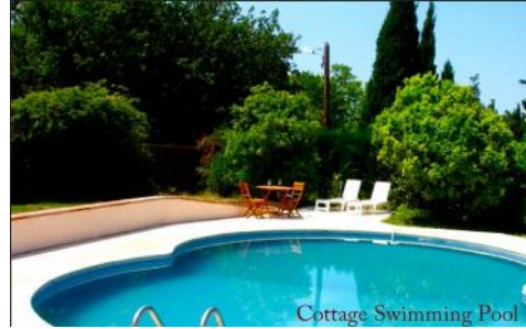
Canigou swimming pool