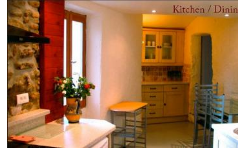
Kitchen / Dining