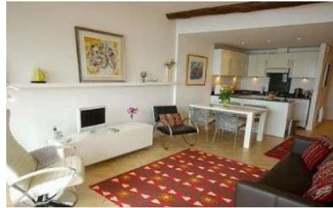
L'Artistes Tresor Living room