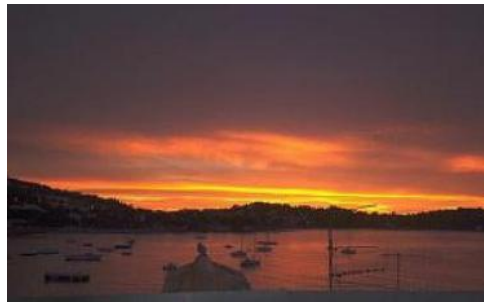
L'Artistes Tresor spectacular sunset