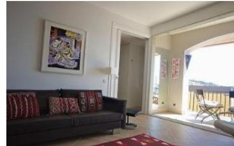
L'Artistes Tresor Living room 2