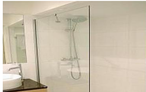
L'Artistes Tresor new shower