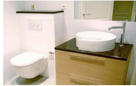
L'Artistes Tresor brand new beautiful bathroom