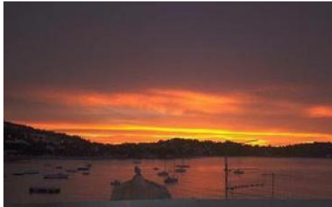
L'Artistes Tresor spectacular sunset