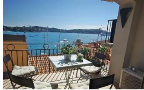
Superb sea view of Villefranche-sur-Mer