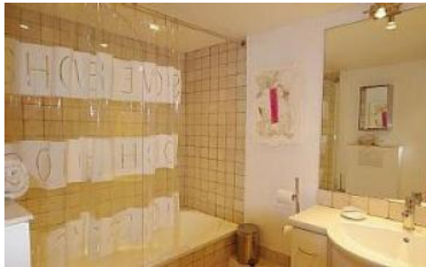
L'Artistes Tresor superb main bathroom