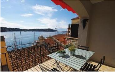
L'Artistes Tresor Superb Sea view 2