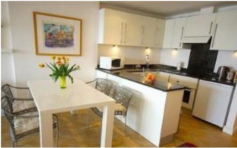
L'Artistes Tresor kitchen