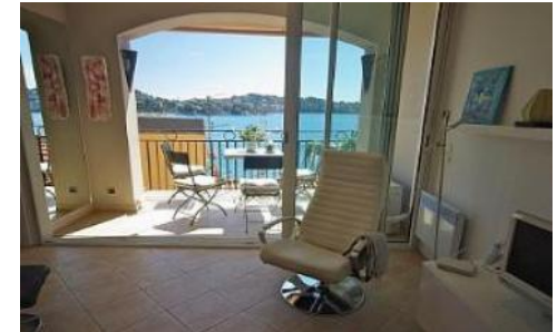
L'Artistes Tresor Superb Sea view from the living room