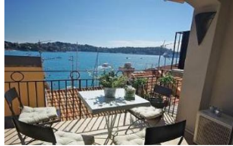
Superb sea view of Villefranche-sur-Mer