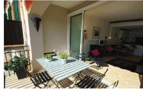
L'Artistes Tresor terrace