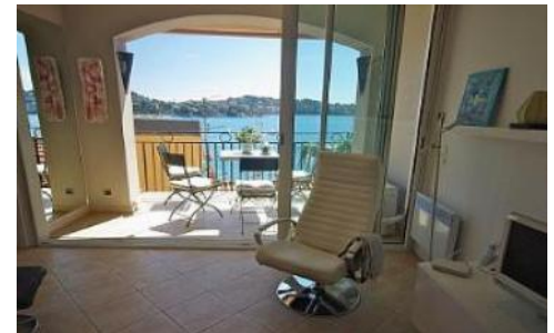
L'Artistes Tresor Superb Sea view from the living room