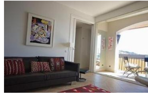
L'Artistes Tresor Living room 2