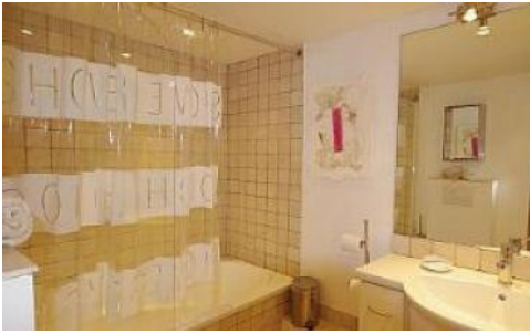
L'Artistes Tresor superb main bathroom