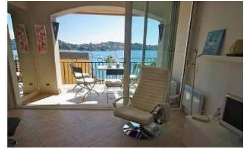
L'Artistes Tresor Superb Sea view from the living room