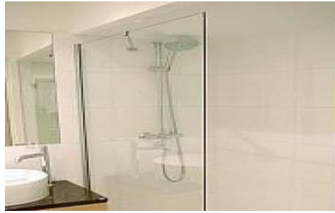
L'Artistes Tresor new shower