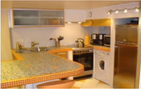
Kitchen with breakfast bar