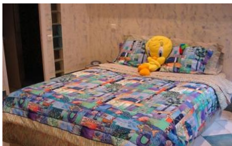
Queen size bed