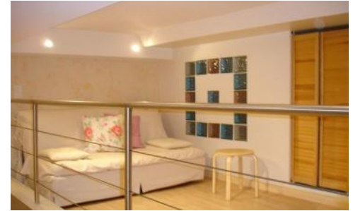
Futon in loft