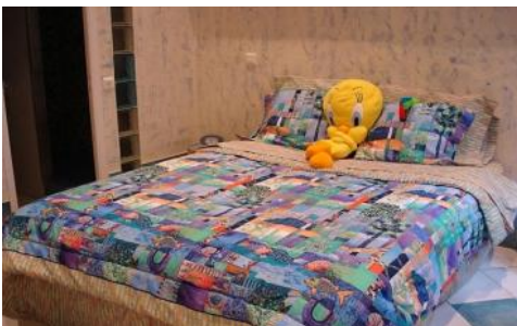
Queen size bed