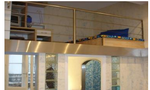
Bedroom, shower and loft