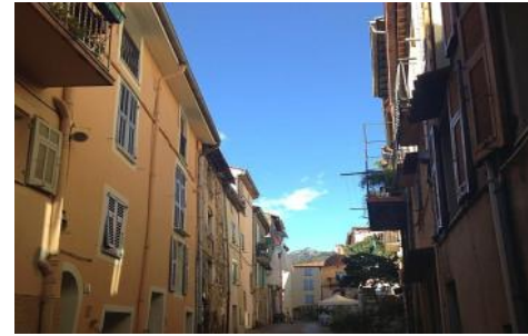
Street in Menton.