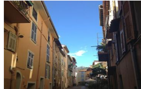
Street in Menton.