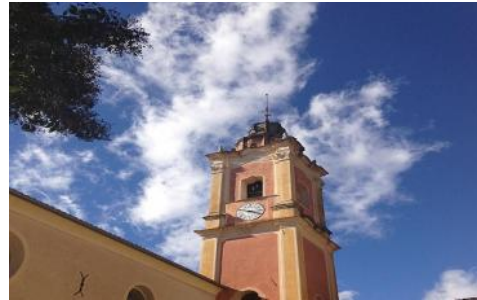
Church in Menton.