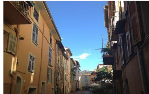
Street in Menton.