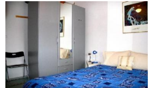
Villa Jessie bedroom bedroom with a big cupboard.