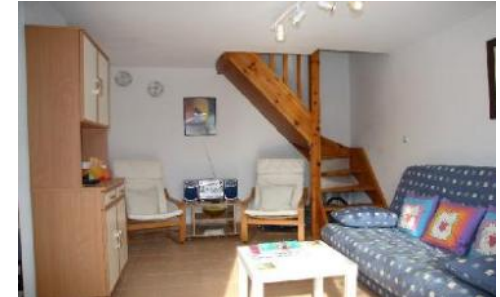
Villa jessie lounge with couch, table and chair and the staircase that leads to the bedrooms