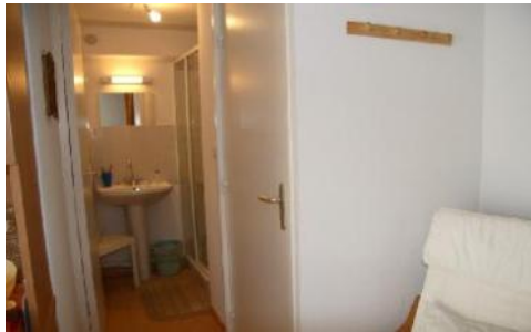
Villa Jessie bathroom