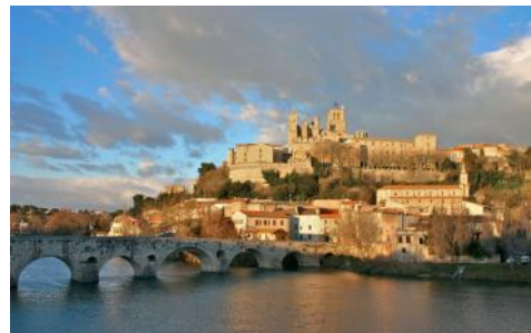
Beziers - 20 minutes away