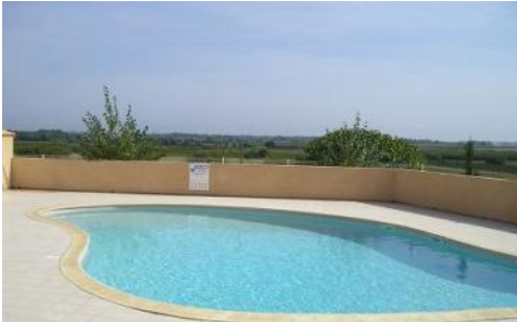
Villa Jessie shared swimming pool in Moulin de la Mer