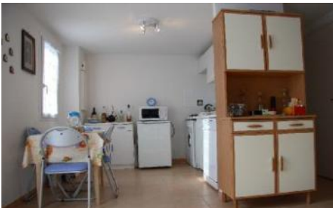
Villa Jessie kitchen view from living room. Equipped kitchen with small dining table & chairs.