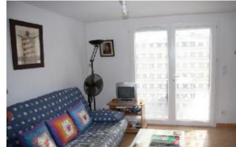
Villa Jessie living room has a couch, table and television. It is joined to the kitchen on the right. The doors lead out to the courtyard.