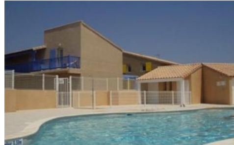
Villa Jessie shared swimming pool with lovely view of vines.