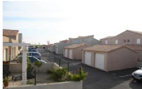
Villa Jessie view from house looking at residence.