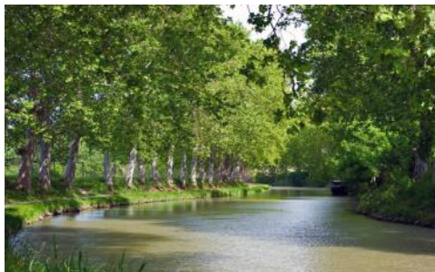
The famous Canal du Midi that runs through the south of France

You will see a lot of the French vines when visiting France.