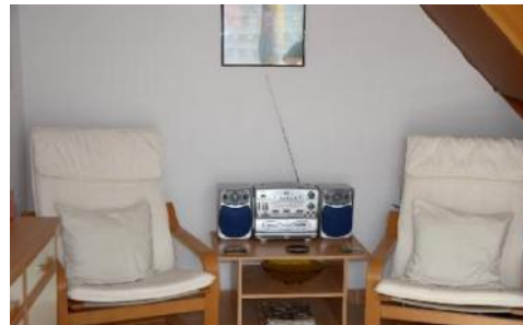
Villa Jessie lounge sitting area with chairs & radio.