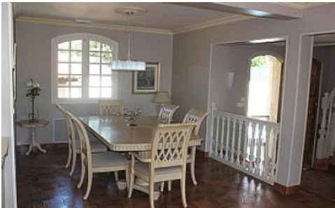
Maison 42's dining room. There's a large dining table with eight chairs. Additional dining chairs are available.