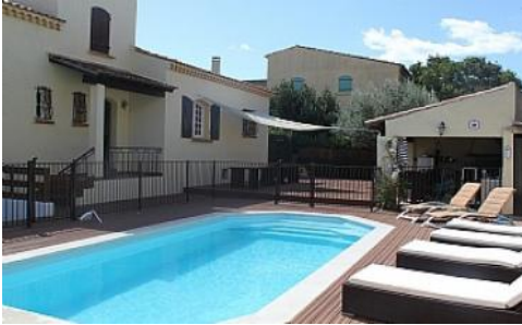
Maison 42 has a large private swimming pool. There are multiple sunloungers and the pool is heated! Luxury villa.