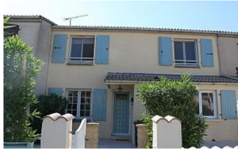
Here is a view of the outside of the Maison Mima. Very cosy and French!