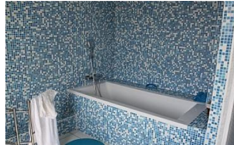
This very originally decorated bathroom in Maison Mima is equipped with a bath, a walk-in shower and 2 basins!