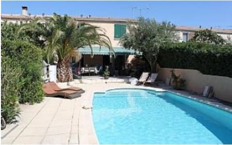
Maison Mima's private swimming pool. It is beautifully located and sees the sun most of the day.