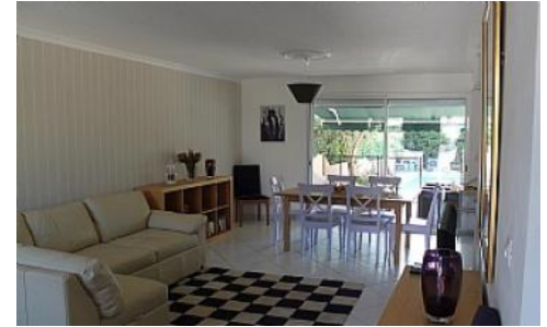
Maison Mima's lounge and dining room are both beautifully decorated with cream sofas, a checkerboard carpet, cable TV, DVD player etc..