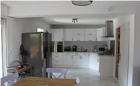
This modern kitchen in Maison Mima is open-plan and fully equipped for your needs!