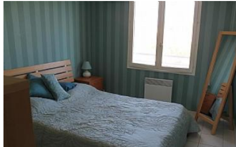
This gorgeous double bedroom in Maison Mima is cosy and spacious with wonderful views from the window.