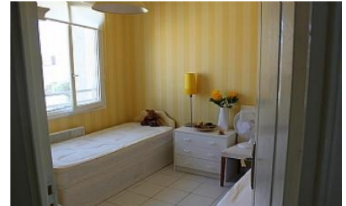
One of the 4 bedrooms in Maison Mima. This bedroom is equipped with twin beds, along with an en-suite shower/sink. Very brightly decorated!