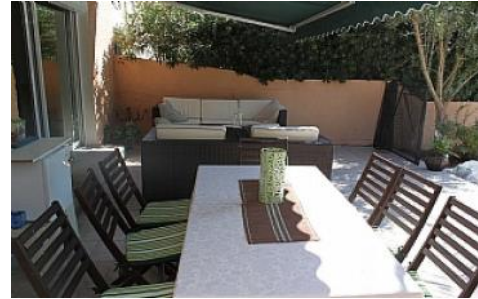
This beautiful terrace at Maison Mima is the perfect place for outdoor dining. It seats 6 people comfortably and overlooks the swimming pool.