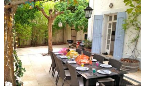
Dining on the terrace