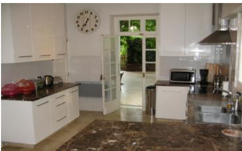
Opne plan kitchen