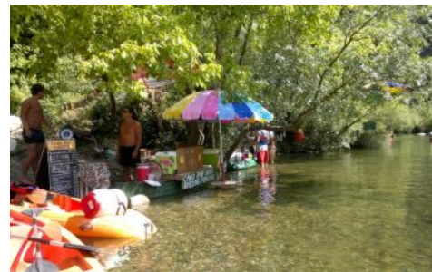
Kayaking on The Herault