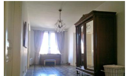
First floor landing