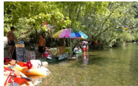
Kayaking on The Herault