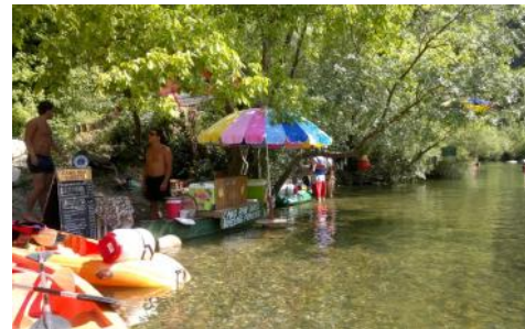
Kayaking on The Herault