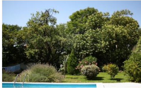
Pool and garden