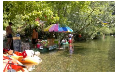
Kayaking on The Herault