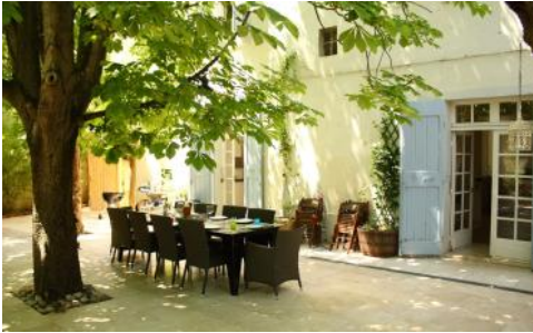
Dining on the terrace