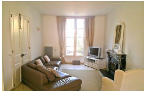
Open plan room