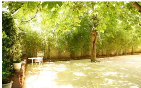
The shaded terrace