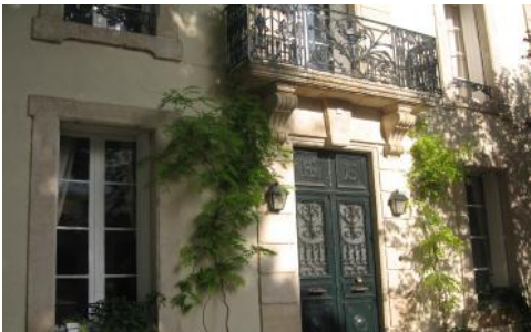
The front door