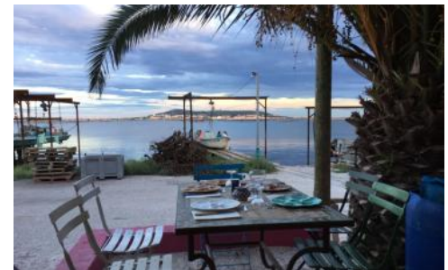
Dining in Bouzigues