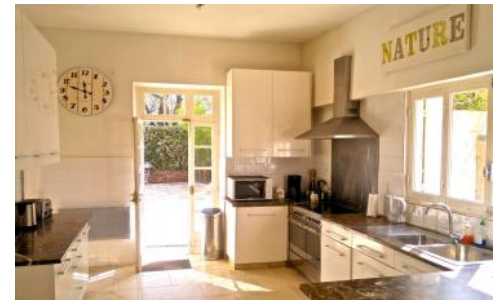
Open plan kitchen