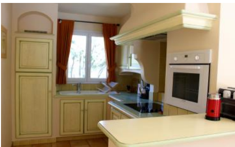
Well equipped kitchen