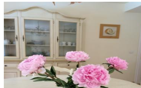
Local market flowers