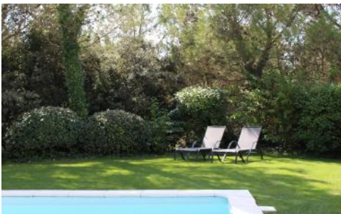
Garden has sun and shaded areas