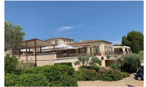
Pont Royal golf clubhouse with bar and restaurant