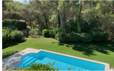
Enclosed private garden