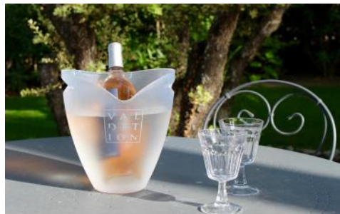
We are in the heart of rose country after all!