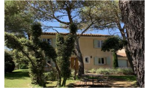
Front of the property