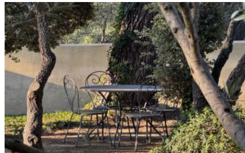
Dining by the pool or under the trees