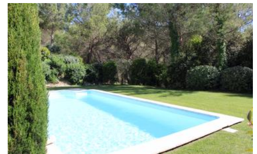
Pool is cleaned twice each week