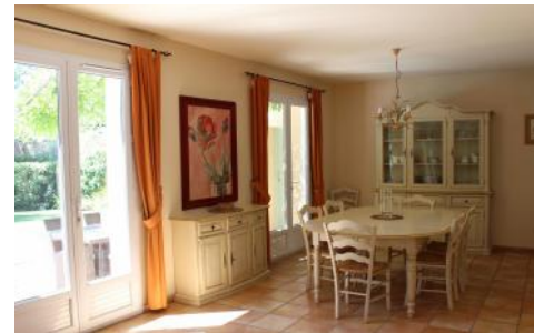
Spacious dining area