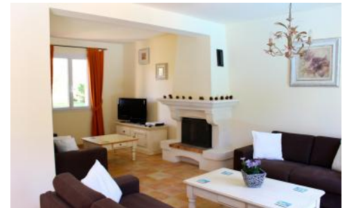
3 sofas, Apple TV and Apple HomePod