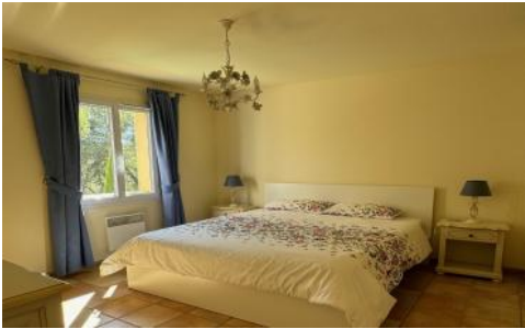
Super king size bed in master bedroom