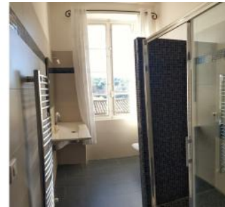
Master bedroom shower