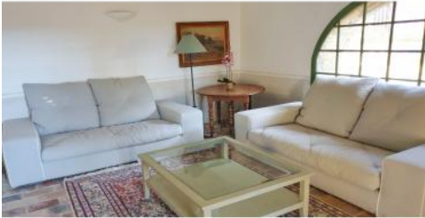
Studio sitting room