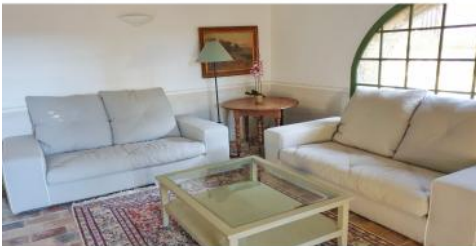
Studio sitting room