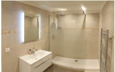
Studio shower room