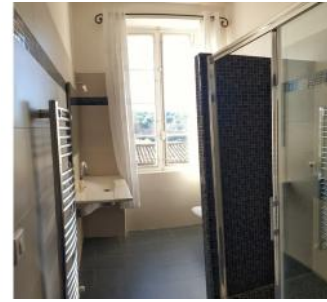
Master bedroom shower