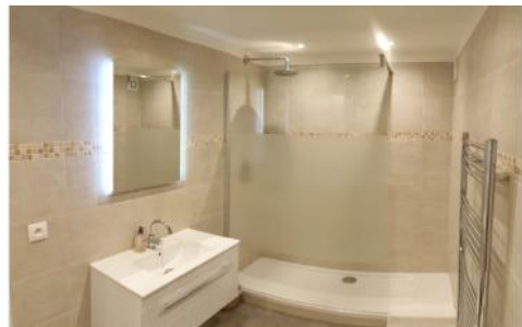
Studio shower room