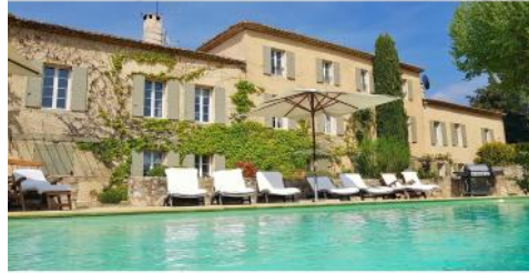
Pool to house