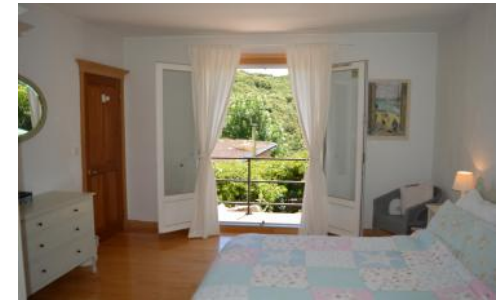
Bedroom with a beautiful view