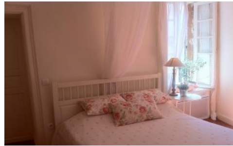
Here is another one of the double bedrooms in Maison Cruzy. Very pretty and pink!