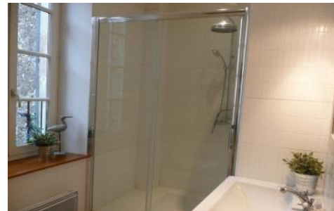
One of Maison Cruzy's large bathroom with water basin, shower and WC.