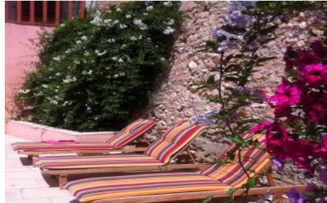
Maison Cruzy offers sunbeds, useful for when you want a day in the sun by the swimming pool.