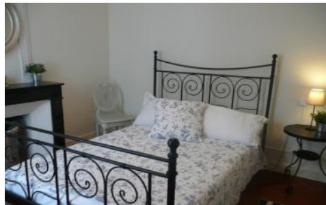
Another view of the double bedroom in Maison Cruzy.