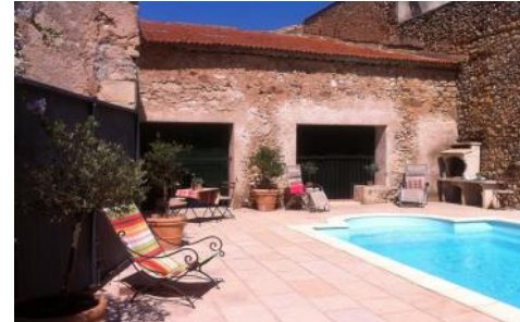
Another view of Maison Cruzy's swimming pool area, complete with a barbecue, sunbeds and sunchairs. Lovely!