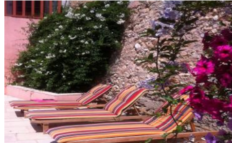
Maison Cruzy offers sunbeds, useful for when you want a day in the sun by the swimming pool.