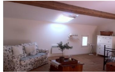
Another view of one of Maison Cruzy's double bedrooms. A comfortable sofa is provided for your relaxation.