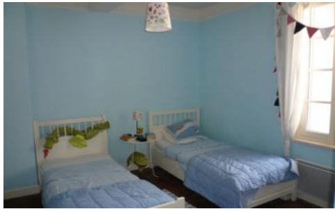
Here is one of the three bedrooms in Maison Cruzy. This is a gorgeous twin bedroom with a walk in cupboard!