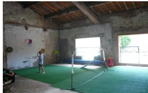
This is a very big barn in Maison Cruzy which is a great place for the kids to do activities. There is a roll out floor that can be used to play badminton/tennis on. You can also play darts and ride bikes here.