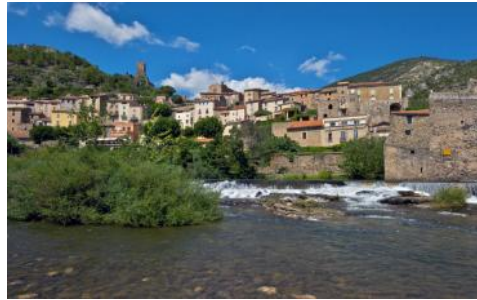
One of the beautiful picturesque places to visit around Cruzy.