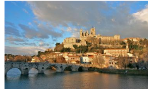
One of the must visit towns around Cruzy is Béziers where you'll find beautiful flower markets.