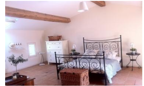
One of the double bedrooms in Maison Cruzy overlooking the courtyard. It is equipped with an en-suite bathroom, as well as an adjoining room with a single bed which could be used for a child.