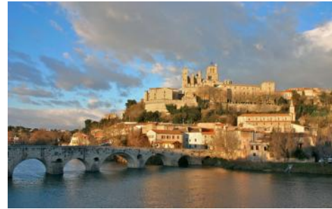
One of the must visit towns around Cruzy is Béziers where you'll find beautiful flower markets.