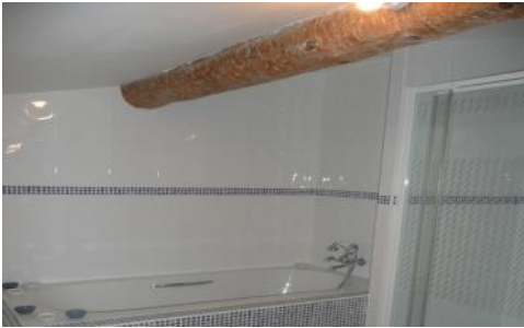
Another one of Maison Cruzy's bathroom complete with a shower and bath.