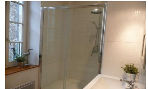
One of Maison Cruzy's large bathroom with water basin, shower and WC.