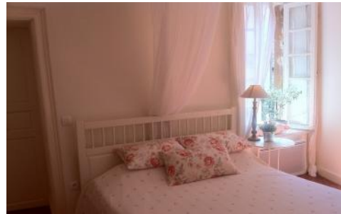
Here is another one of the double bedrooms in Maison Cruzy. Very pretty and pink!