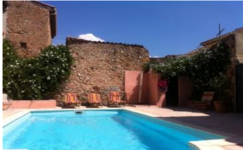
Maison Cruzy's glorious swimming pool, this is the perfect place for relaxing in the sun, sunbathing, and splashing around in the pool!