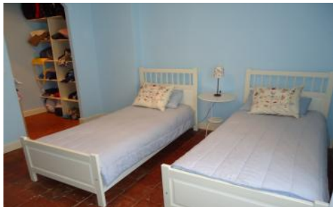
Another view of the twin bedroom in Maison Cruzy. Perfect for your children!