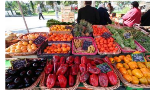
One of the many markets to be explored in towns and villages all around Cruzy!