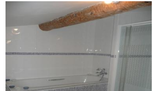
Another one of Maison Cruzy's bathroom complete with a shower and bath.