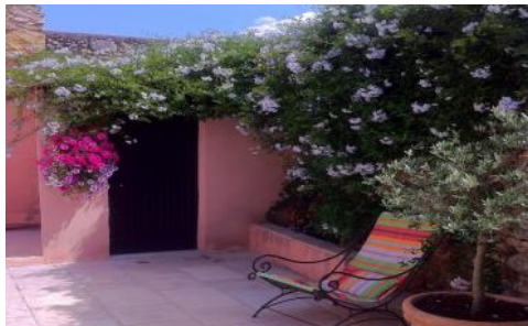
Another view of Maison Cruzy's outside area, the plants and deco offers a relaxing and exotic area to spend your days.