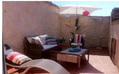
Maison Cruzy offers a relaxation zone, this is a great place for evening drinks and relaxing during the day.