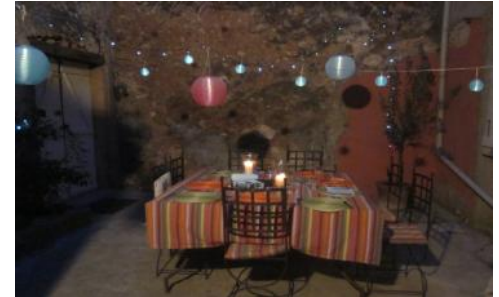
What a beautiful place for an evening meal. Maison Cruzy's outside dining area is truly beautiful. Breakfast, lunch and dinner can all be eaten here in this outdoor environment.