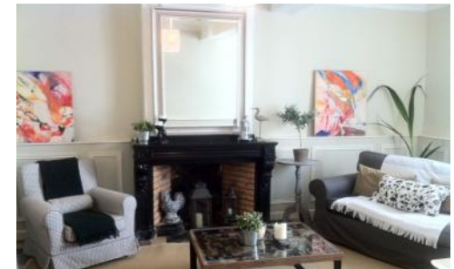
Here is one of the two comfortable and modern living rooms in Maison Cruzy. Wifi is available throughout the whole house so this is a great place to sit back and relax, whether you're surfing the web or reading a great book.