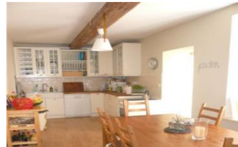
Maison Cruzy's smart kitchen with all the amenities. The dining room table can seat 8 easily, which makes it a comfortable place for dining.