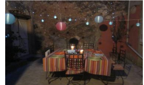
What a beautiful place for an evening meal. Maison Cruzy's outside dining area is truly beautiful. Breakfast, lunch and dinner can all be eaten here in this outdoor environment.