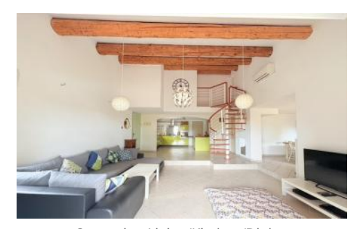
Open plan Living/Kitchen/Dining