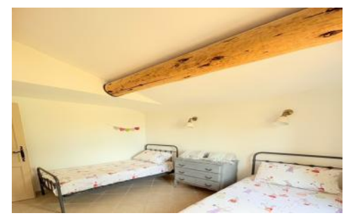
Downstairs twin bedroom