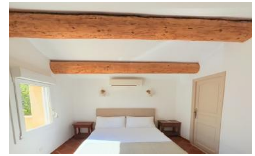
Upstairs back bedroom