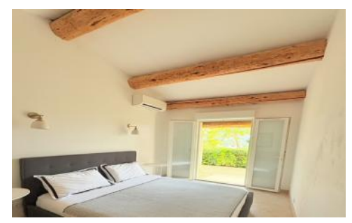
Downstairs Terrace Bedroom