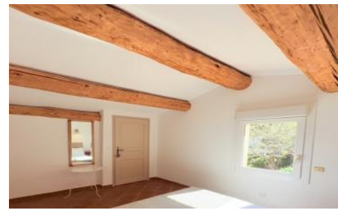
Upstairs back bedroom