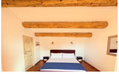
Upstairs front room with balcony