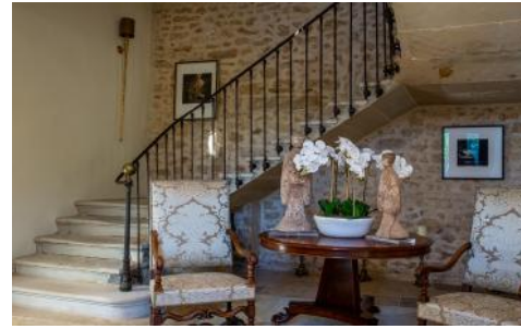
Grand staircase to four bedroom suites