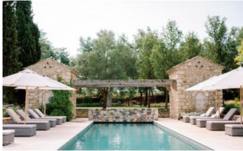
4m x 17m salt water pool