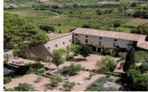
Aerial view of house