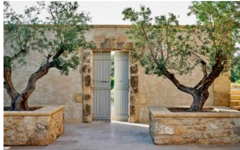
Gates to vineyard