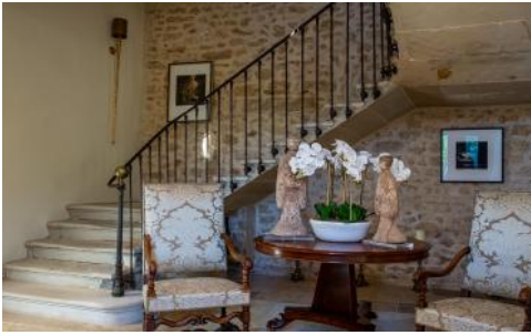
Grand staircase to four bedroom suites