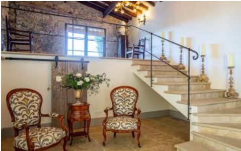
Stairs to Principal Bedroom