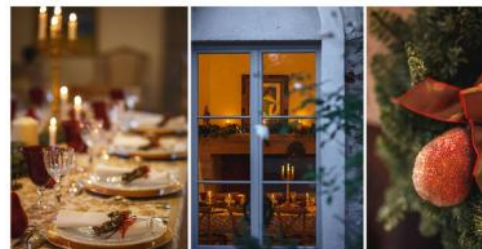
Christmas in the South of France