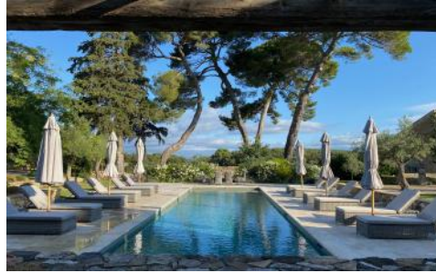
Pool with a view