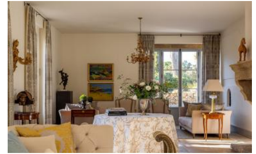
Le Grand Salon