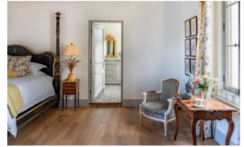
Views to garden