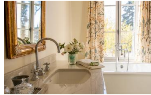
Bathroom overlooks courtyard