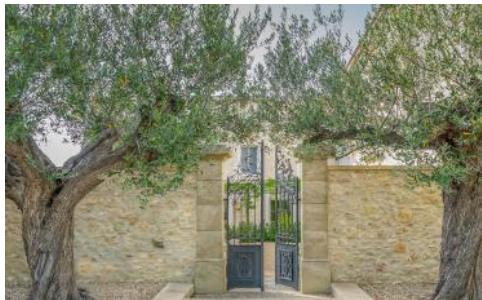
Gates to courtyard