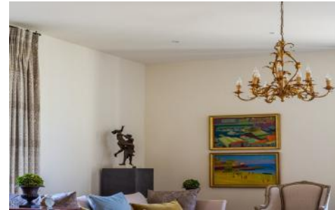
Multiple seating areas