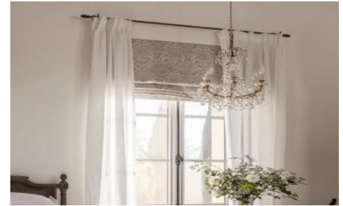
Views to garden