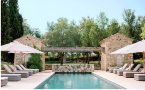
17m saltwater pool