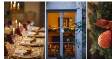
Christmas in the South of France