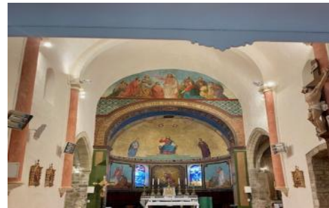
Bassan village Church