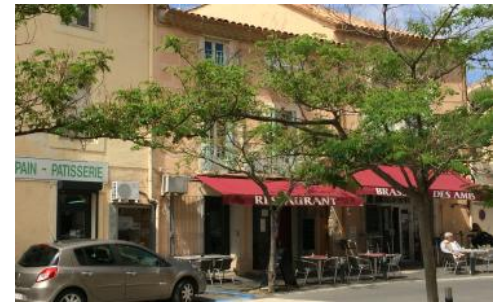
Bassan village Pub