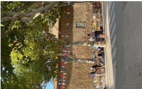
Bassan village markets