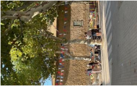
Bassan village markets