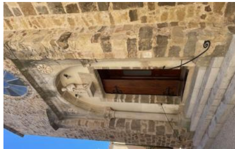
Bassan village church