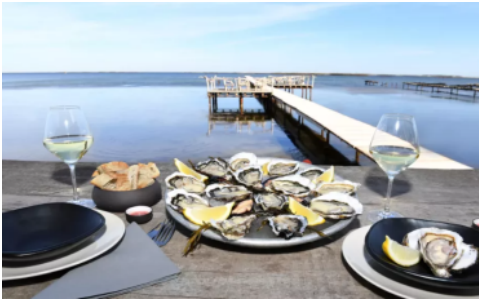
Oysters at Tarbouriech