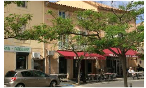
Bassan village Pub