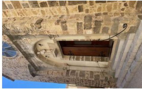
Bassan village church