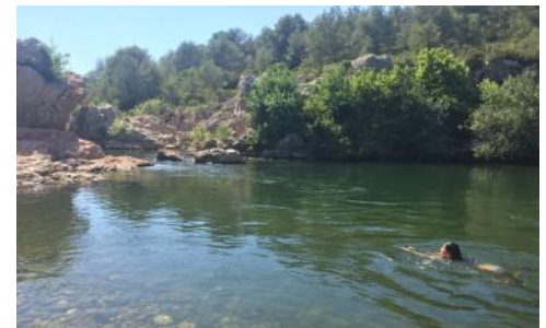
Swimming in the Orb