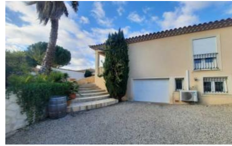
Garage and parking