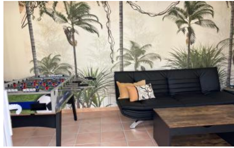
Guest house / Game room