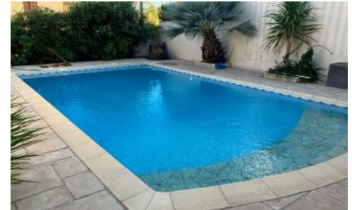
Pool with steps