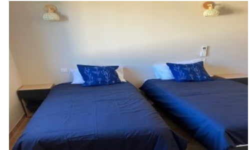
Bdrm2 Single beds