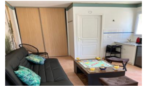
Guest house with bathroom