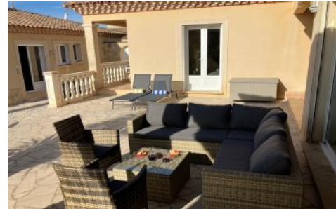
Outdoor living room