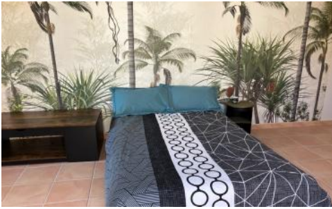
Guest house sofa-bed setup