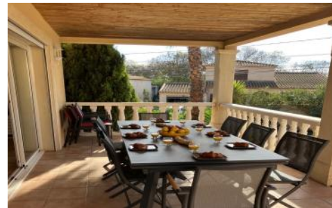
Terrace dining for 8-12