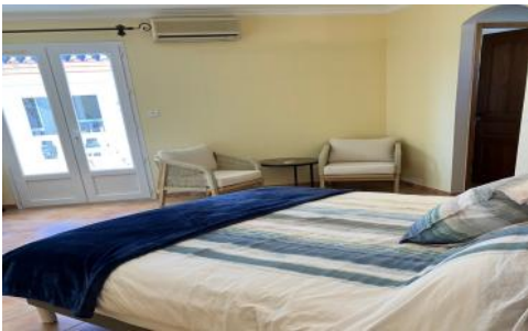
Master bdrm sitting area