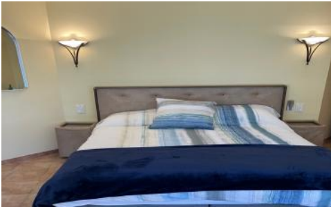
Master bdrm King bed