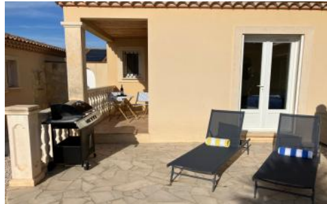
More sun lounging