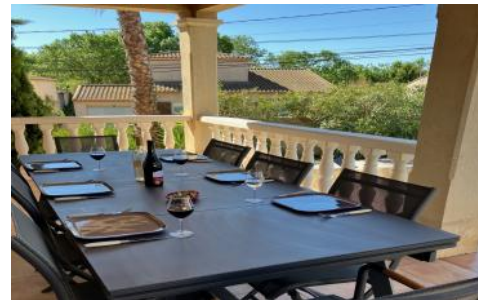
Terrace dining for 8-12