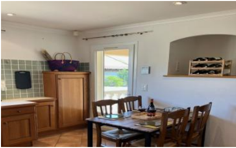
Kitchen dining area