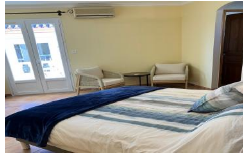
Master bdrm sitting area