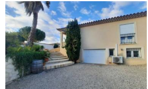
Garage and parking