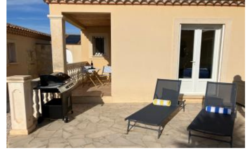
More sun lounging