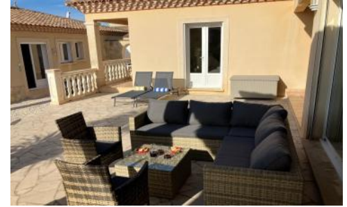
Outdoor living room