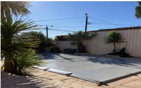
Pool safety cover for children