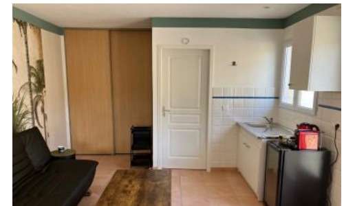
Guest house with bathroom