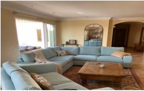
Living room seating