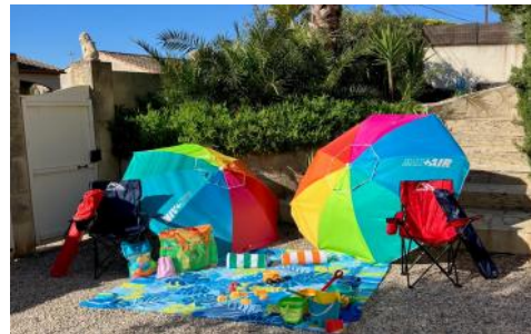
Bring on the beach!