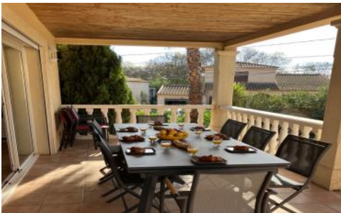
Terrace dining for 8-12