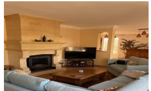
Living room TV watching