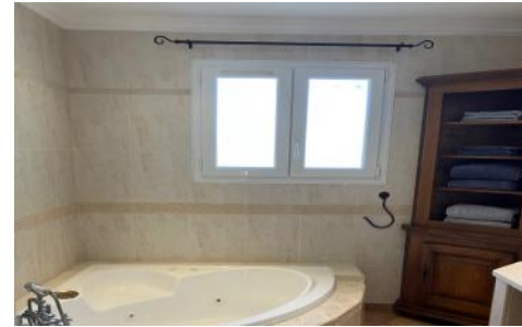
Main bathroom jacuzzi