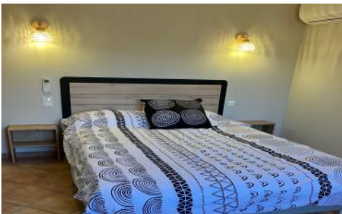
Bdrm3 Queen bed