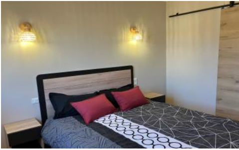
Bdrm4 Queen bed