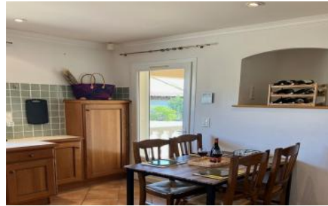
Kitchen dining area