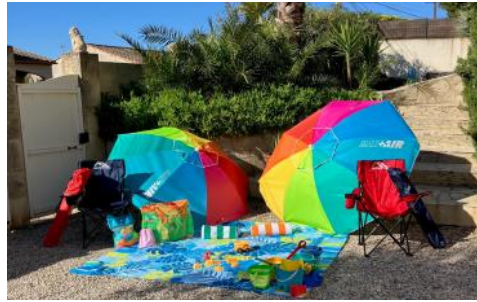
Bring on the beach!