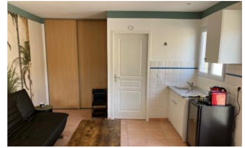
Guest house with bathroom