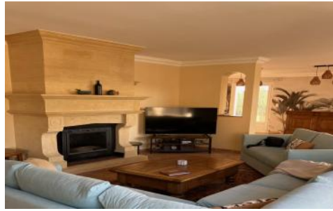
Living room TV watching