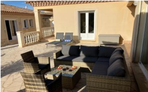
Outdoor living room