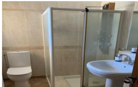
En suite bathroom