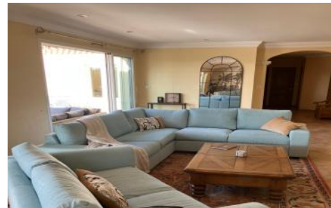
Living room seating