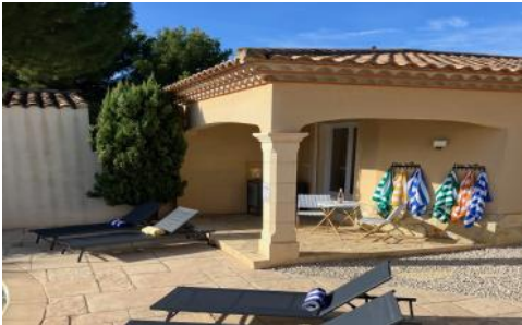
Guest house and sun lounging