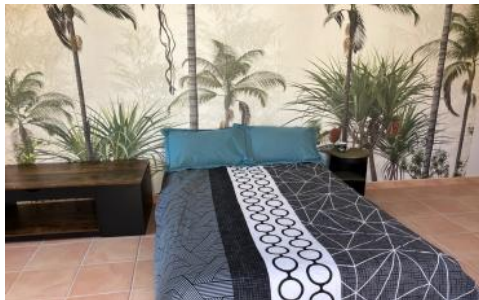
Guest house sofa-bed setup