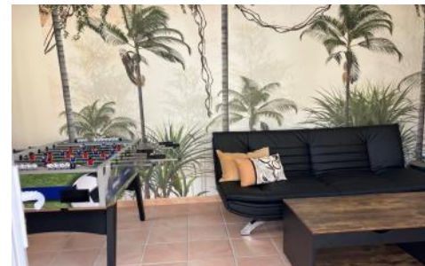
Guest house / Game room