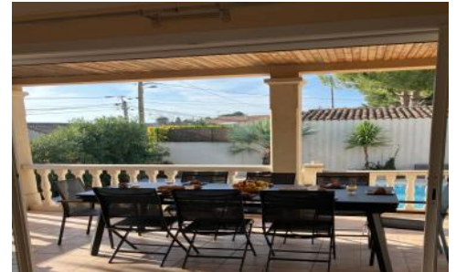
Terrace dining access