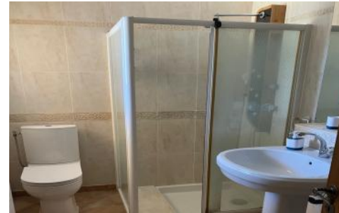
En suite bathroom