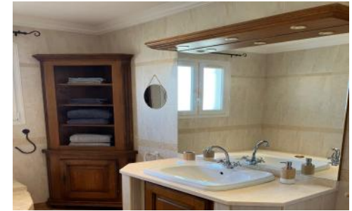
Main bathroom sink