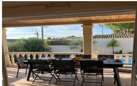
Terrace dining access