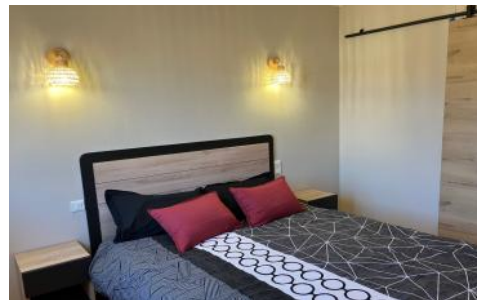
Bdrm4 Queen bed