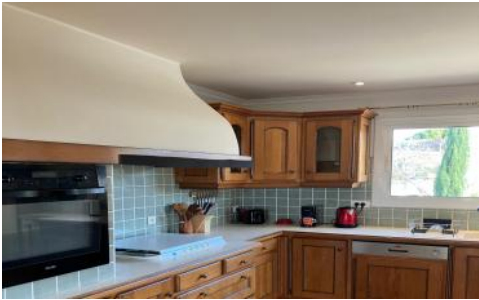
Kitchen cooking area