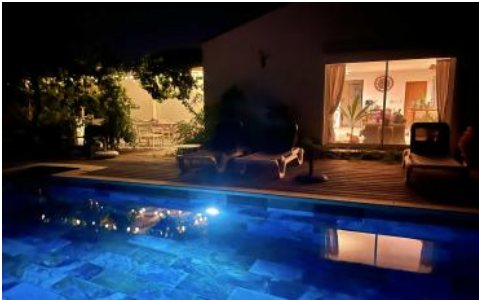
Pool by night