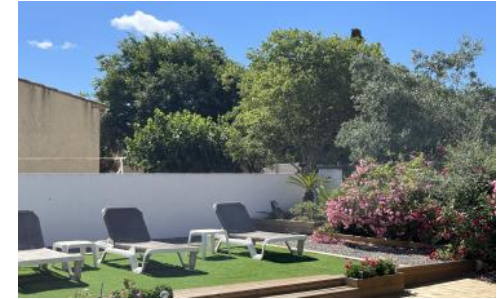
Sun Bed Area