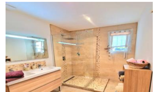
Master En suite Bathroom