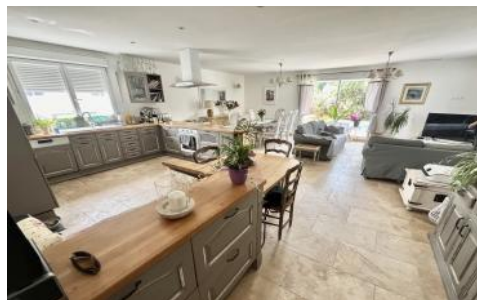
Open plan Kitchen/Diner/Lounge