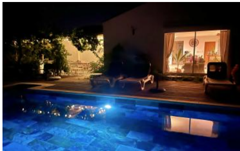
Pool by night