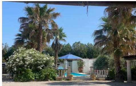
View from west wing