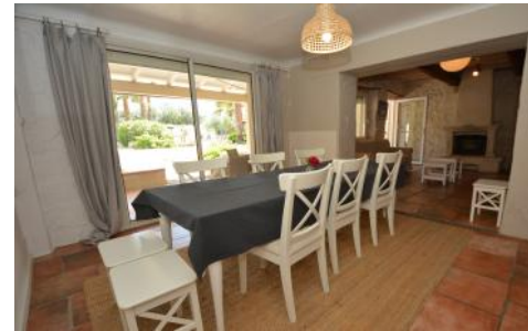
Mas dining area