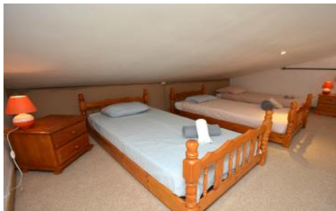
West wing mezzanine