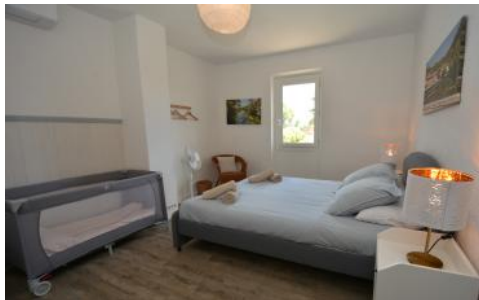
Mas bedroom 2