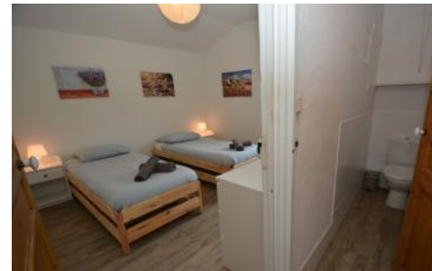
Mas bedroom 3