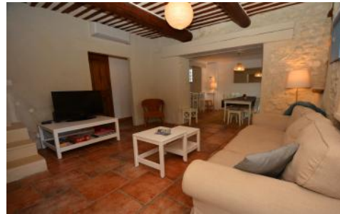
Mas living room