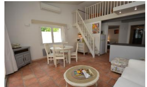
West wing interior