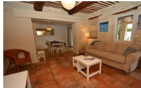
Mas living room