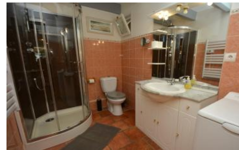
West wing bathroom