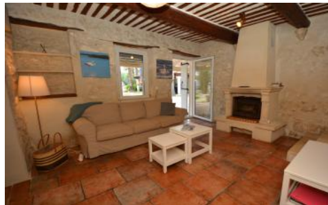
Mas living room