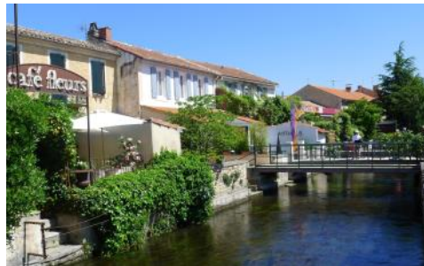
Isle sur la Sorgue