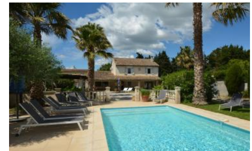
Mas view from pool