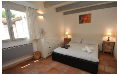
West wing bedroom