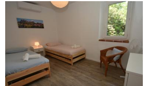
Mas bedroom 4