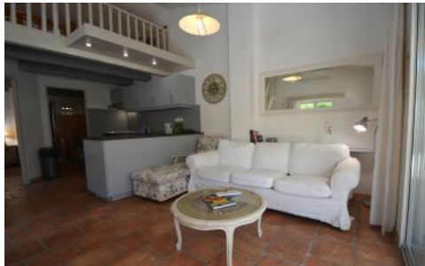
West wing living room