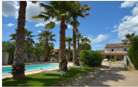
Boules court and pool