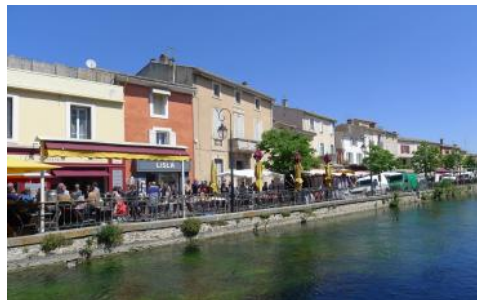
Isle sur la Sorgue