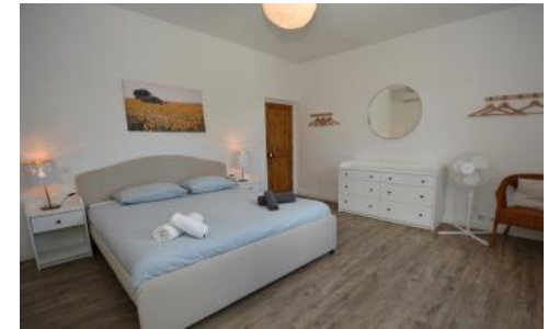
Mas bedroom 1