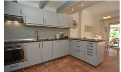
West wing kitchen