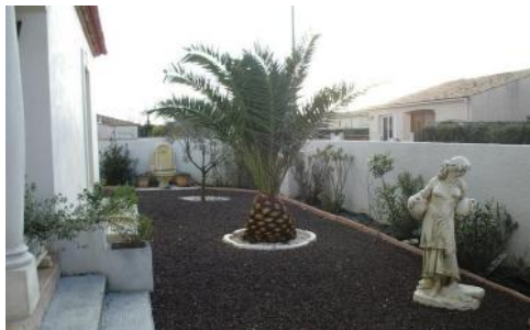
Front of villa