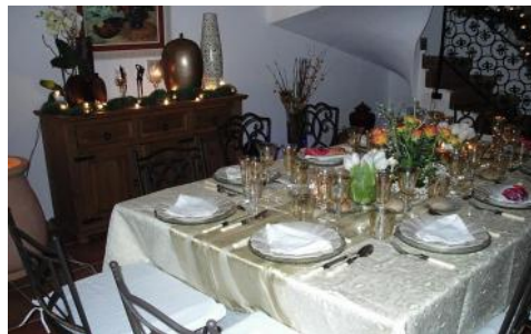
Table set for fine dining!