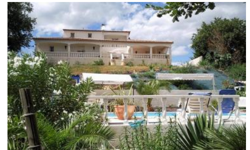
Villa from lower garden