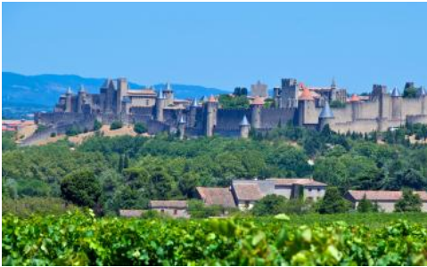
Carcassonne, a bit over an hour away