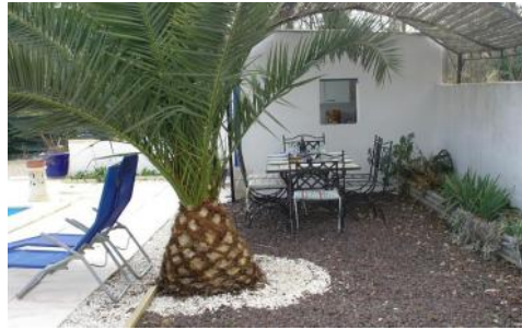
Shady eating area by pool