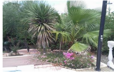
Solar shower by pool