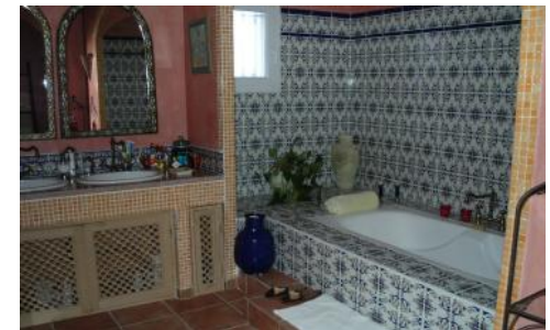
Ensuite bathroom to top bedroom