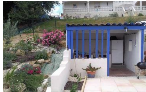
Summer kitchen by pool