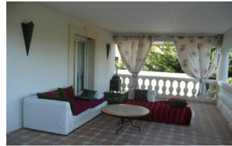
Dining and lounge