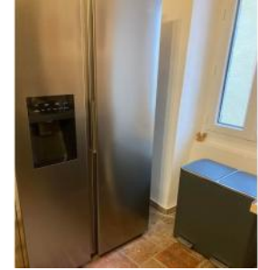
Big American fridge