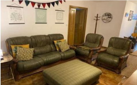
Sitting area with Scottish upholstered footstool