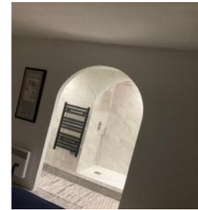
Super king ensuite