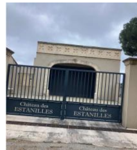
Lovely organic winery 50 steps from the apartment