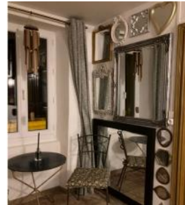
Marvellous mirror wall