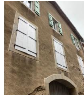
Entrance to the apartment