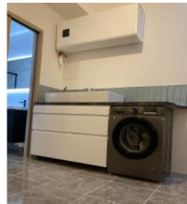
Laundry/ utility area