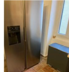
Big American fridge