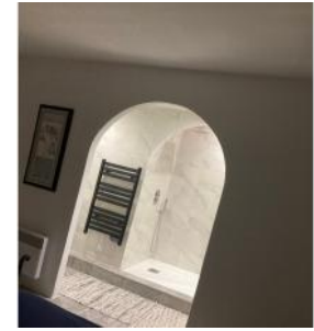
Super king ensuite