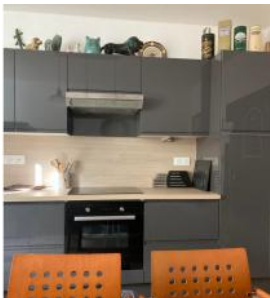
Newly renovated kitchen