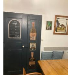
Handmade scaffold board table