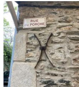
Ancient streets of village