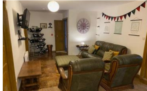
Sitting area with vintage wine collection