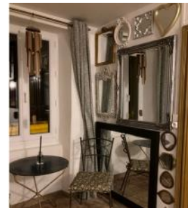
Marvellous mirror wall