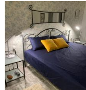
Super king size bed with open en-suite