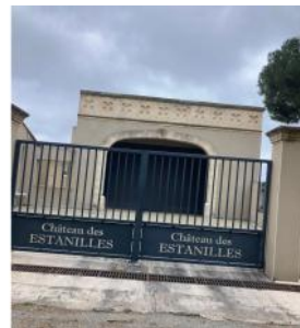
Lovely organic winery 50 steps from the apartment