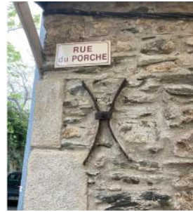
Ancient streets of village