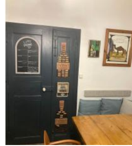
Handmade scaffold board table