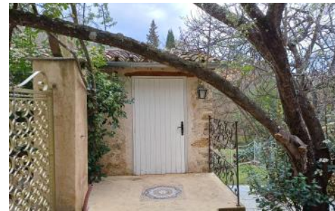
Cottage main entrance