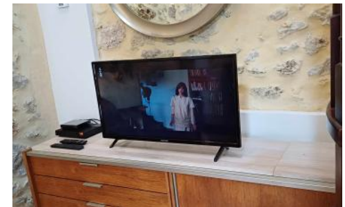
1st fl TV