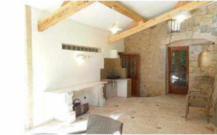
3 east terrace - Terrasse est