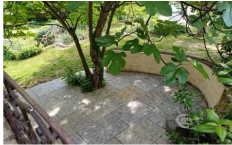
Cottage terrace figuier