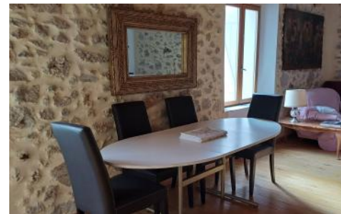
1st floor office