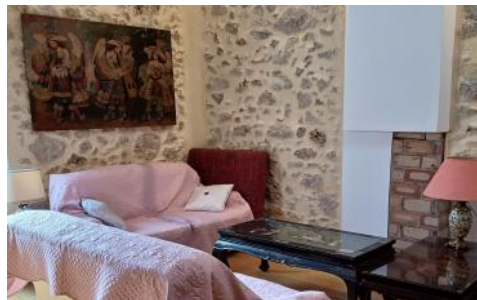
1st Fl. Saloon TV