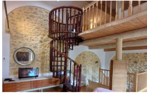
1st Fl. Salon TV to the bedroom