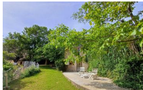
going to garden