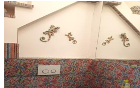
MAS WC Guests