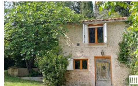
Cottage entrance cuisine