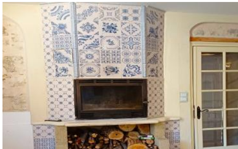
Fire place insert