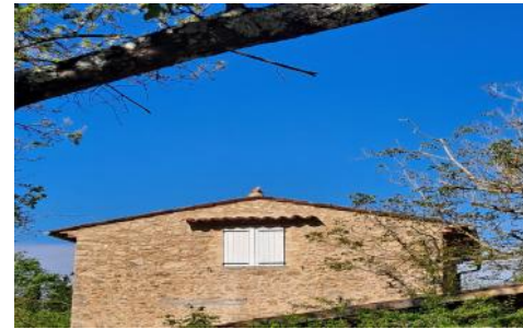
Stone MAS (Provençal Farm house) Entrance