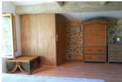
Mezzanine corner WC