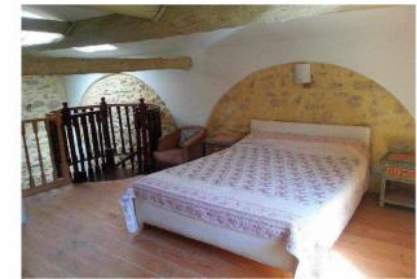
Mezzanine Loft style bedroom