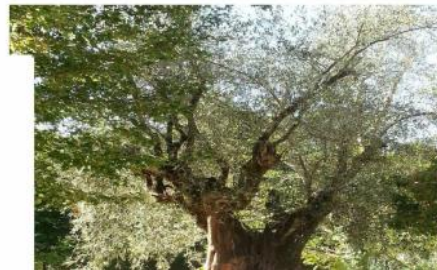
Olive three 200yrs old