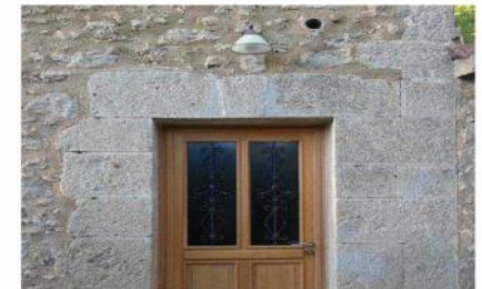
Main door stone framed