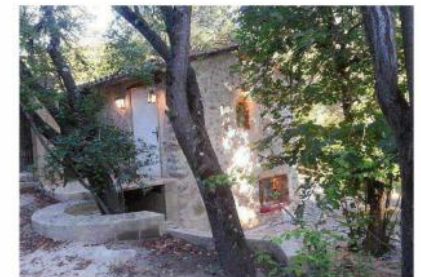
18th stone cottage