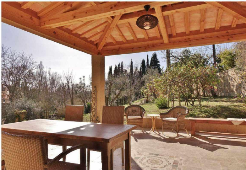
18 west terrace -Terrasse est