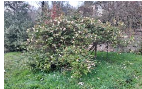
200 yrs Rose plant