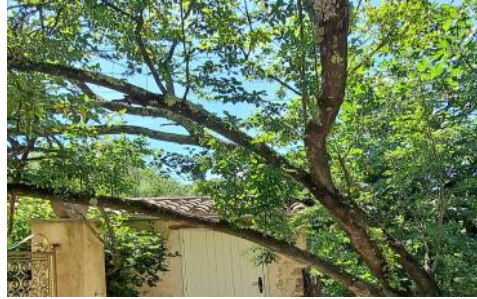
Cottage entry 1st Floor