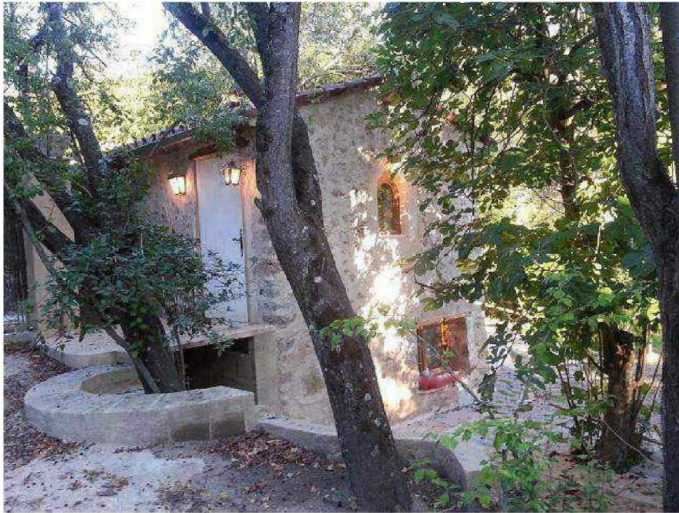
4 Cottage - Dependence