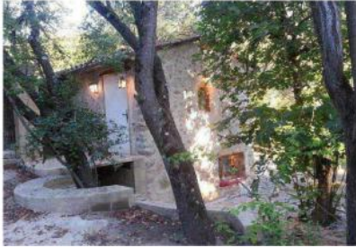
18th stone cottage