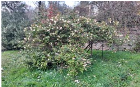
200 yrs Rose plant