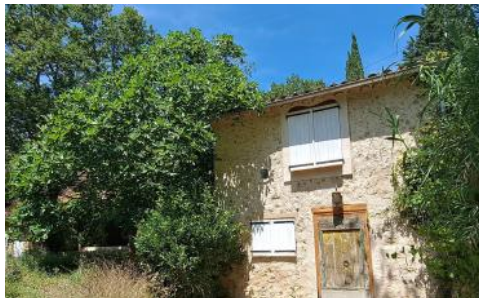
Cottage south face