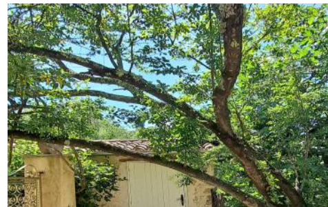
Cottage entry 1st Floor