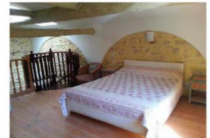
Mezzanine Loft style bedroom