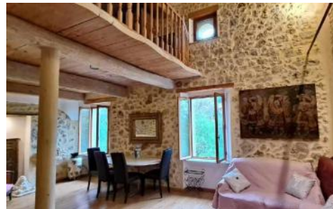
1st fl saloon