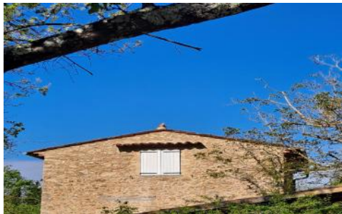
Stone MAS (Provençal Farm house) Entrance