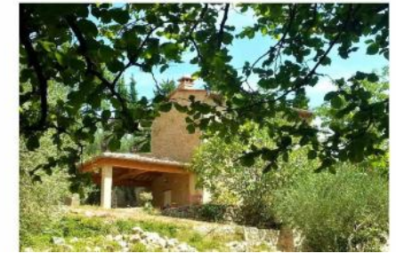
South west side