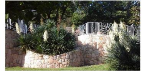
15/1 Yuccas in flower - Les Yuccas fleuries