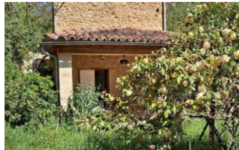
Mas west Face