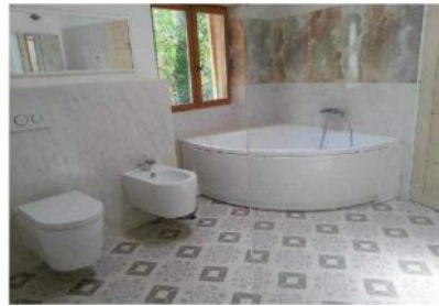
Main Bath Corner Bathtubs,WC, Bidet,