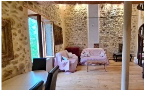
1st fl. saloon