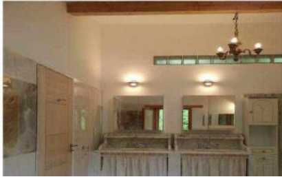
Main Bath 2 Marble lavabos