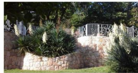
15/1 Yuccas in flower - Les Yuccas fleuris