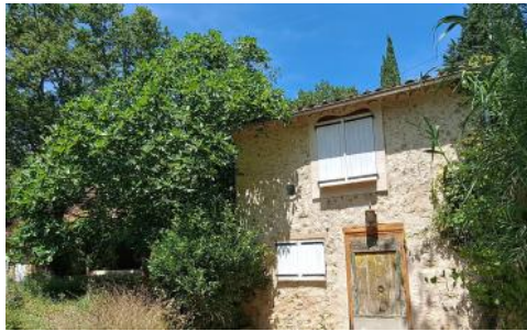
Cottage south face