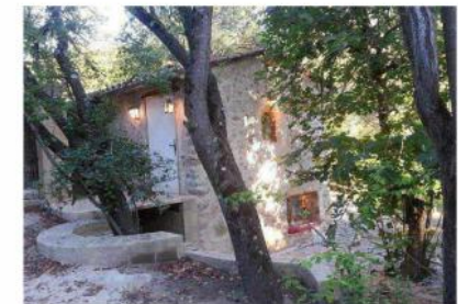
18th stone cottage