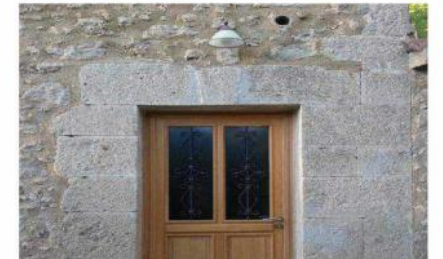
Main door stone framed