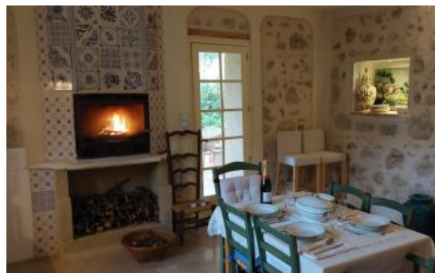
Kitchen dining room