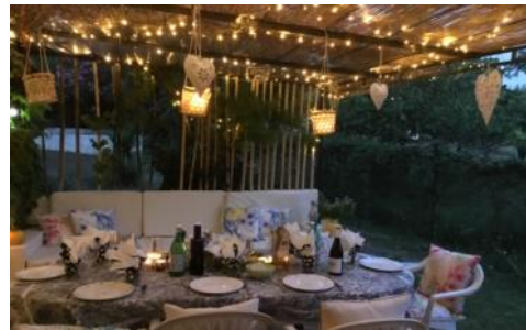
Fairy lit kitchen terrace