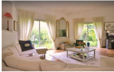
Open plan sitting room