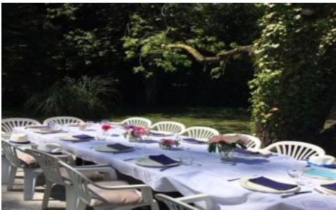
dining in the garden