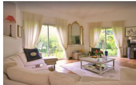
Open plan sitting room