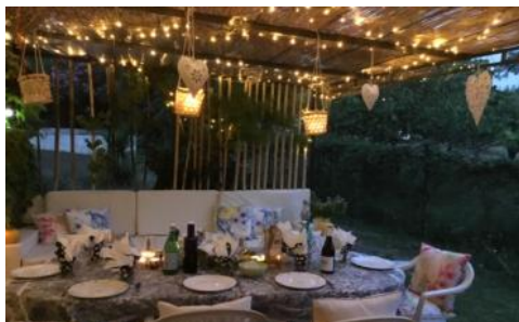
Fairy lit kitchen terrace