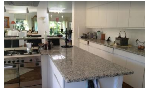
Open plan kitchen