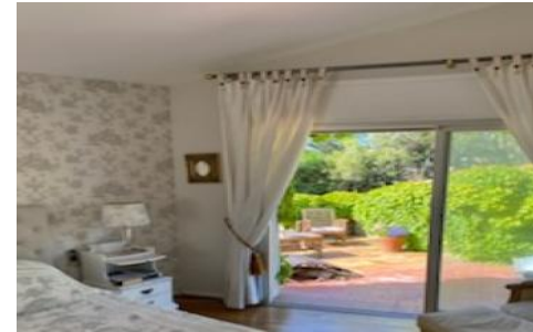
Main bedroom with king sized bed dressing room bathroom and sunny private terrace