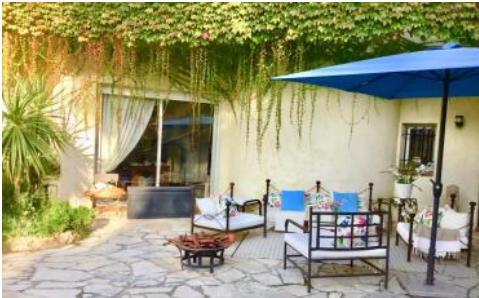
Terrace by pool