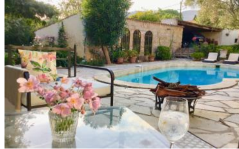
Rose wine by the pool watching sunset