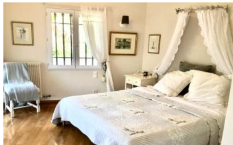
King bed private terrace overlooking pool and gardens