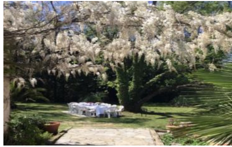
Garden table seating 10 under mature trees