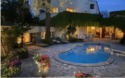
Evening by pool