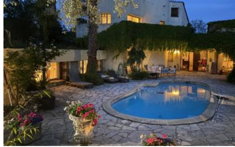
Evening by pool