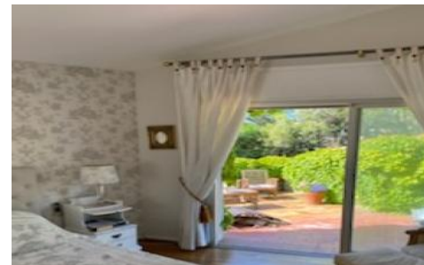
Main bedroom with king sized bed dressing room bathroom and sunny private terrace