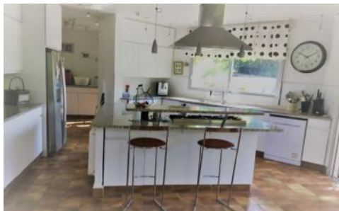
open plan kitchen