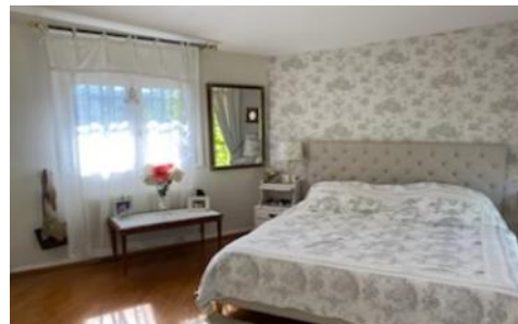
master bedroom with A/C