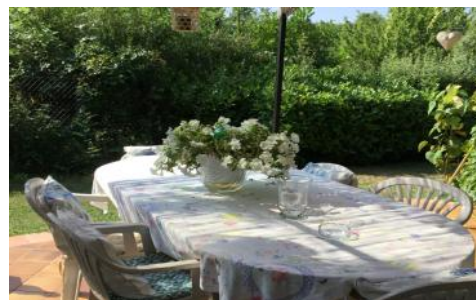
Kitchen terrace sofa breakfast table