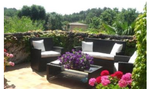
private terrace off main bedroom