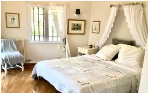
King bed private terrace overlooking pool and gardens