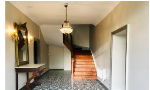
The entrance hall at the front