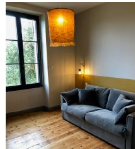
Communicating Living room of bedroom