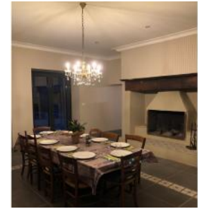
You can eat 12 comfortably