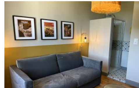
Suite of the bedroom