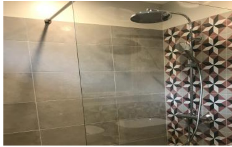
Shower on the first floor