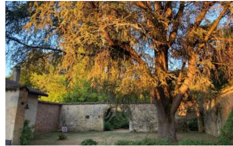
Very pleasant shady place in the courtyard