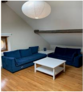
Living room on the 2nd floor