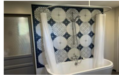
Bath/shower in the ground floor bathroom