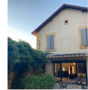
Inner courtyard, relaxation area