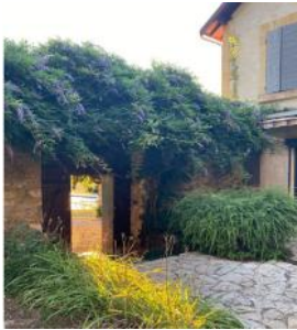
Door leading to the pool from the courtyard