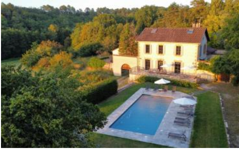
Surrounded by nature