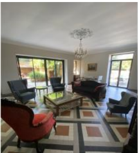
The main living room on the ground floor