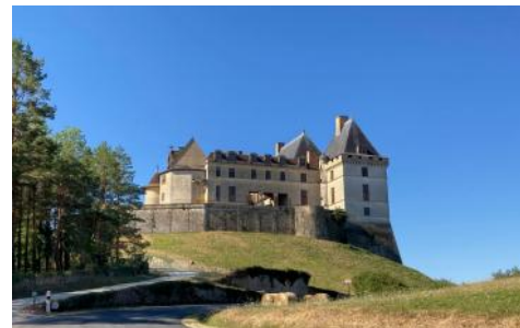
Chateau de Biron (4km)