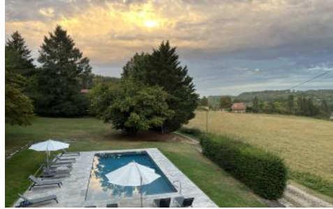
Swimming pool overlooking the meadow