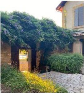
Door leading to the pool from the courtyard