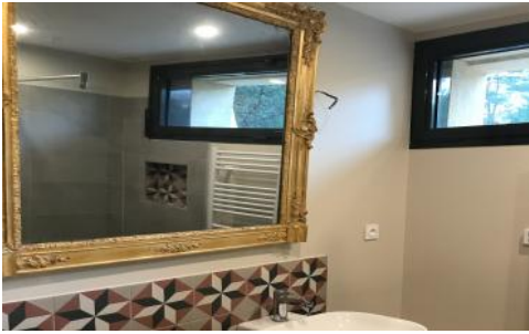
Bathroom on the first floor