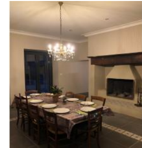
You can eat 12 comfortably