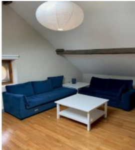
Living room on the 2nd floor