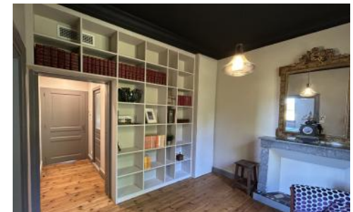
Library suite of bedroom