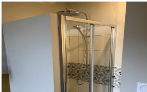
Shower of the suite