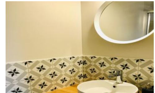
Sink of the suite