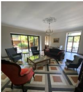
The main living room on the ground floor