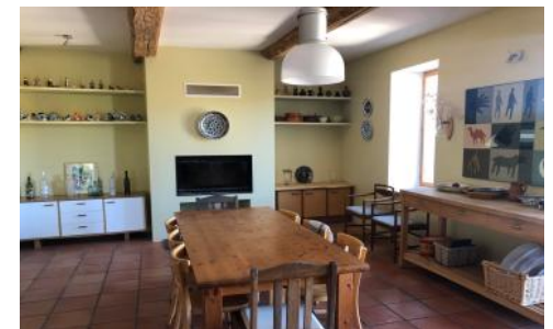
Large table for family dining