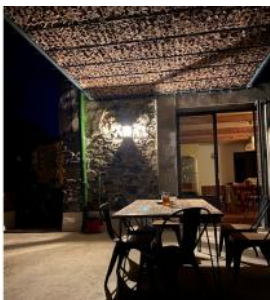
Terrace at night