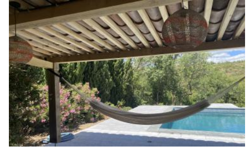
Pool and pergola