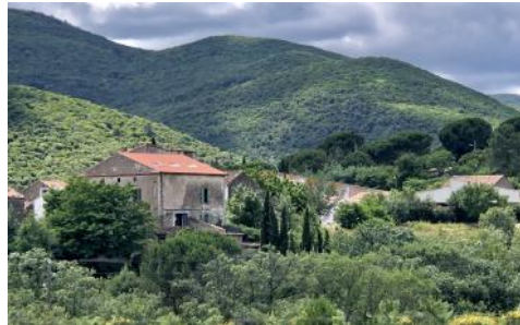
House in the hills