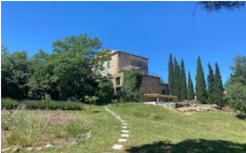
House seen from bottom of the garden