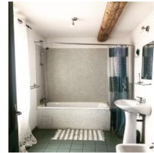
En-suite bathroom of masterbedroom