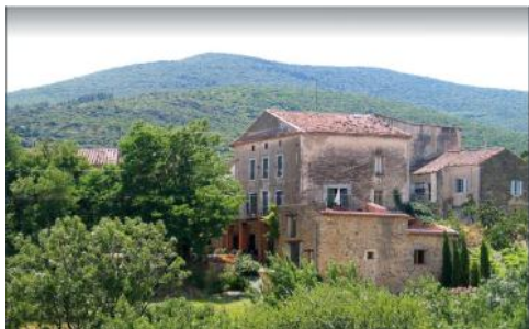
House and garden