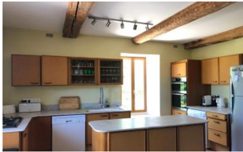
Kitchen and island