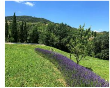
Lavenders in the garden