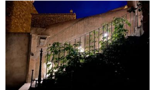
Steps lit up