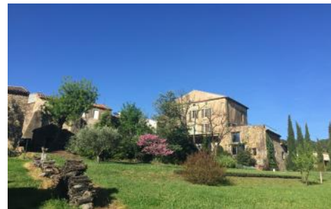
The house and the lawn