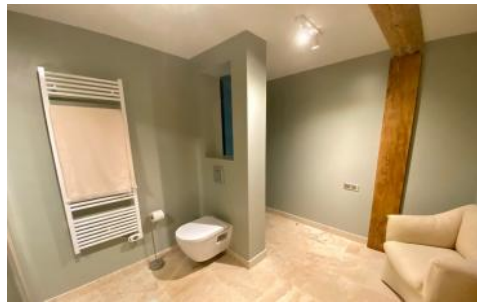
Newly renovated shared bathroom