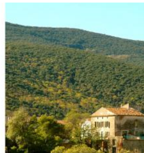
The house surrounded by hills