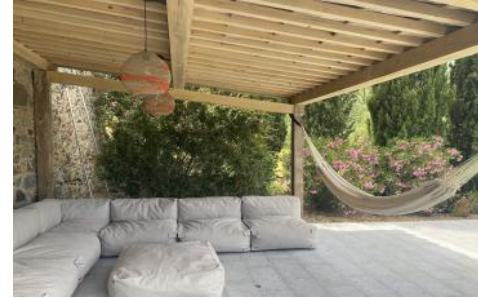
Pergola by the pool