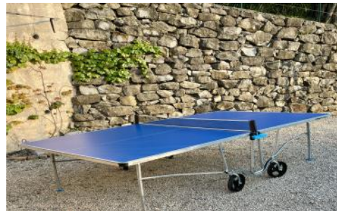
New Table Tennis Table