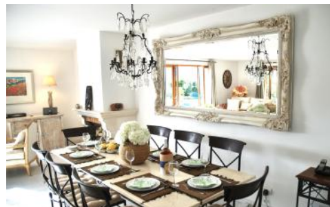
Marble Dining Table