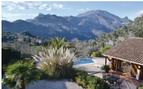
View from top of garden