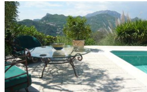
View from garden chairs