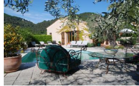
Back to villa from garden chairs