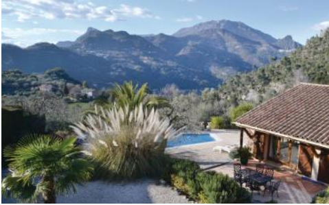
View from top of garden