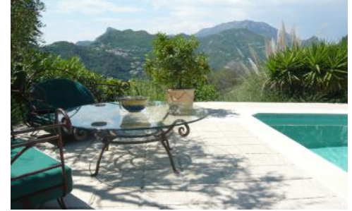
View from garden chairs