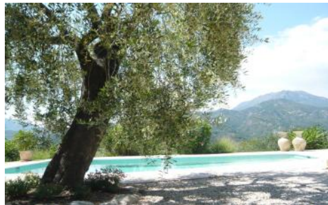
View from Patio Dining