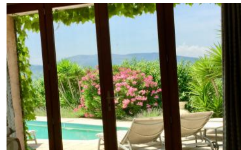
View from lounge