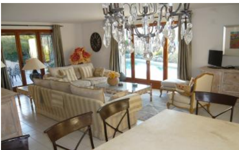
Dining to Lounge