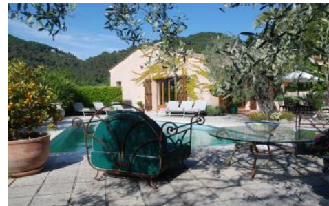
Back to villa from garden chairs