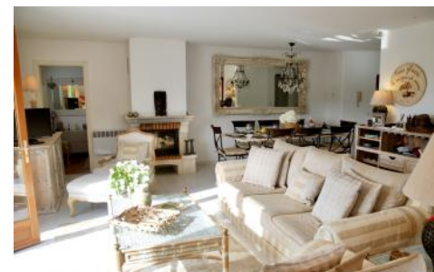
Lounge to Dining Table