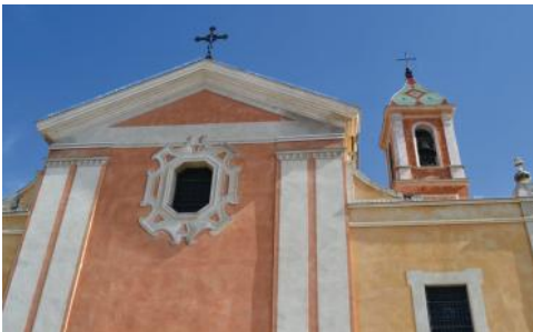
La Roquette church