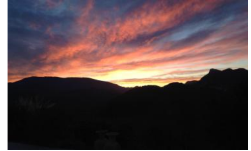
Sunset from terrace