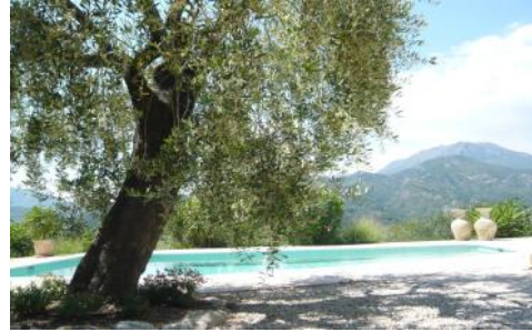
View from Patio Dining