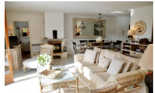
Lounge to Dining Table