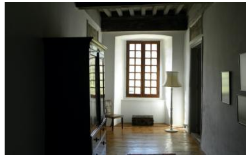
First floor landing