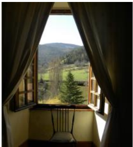
Second floor landing