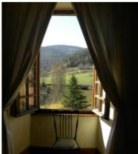
Second floor landing