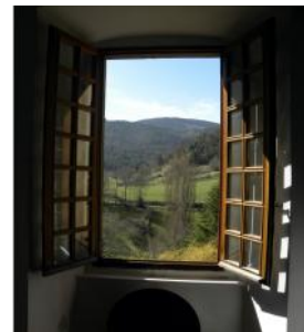
Second floor landing