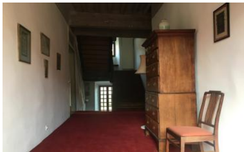
Second floor landing