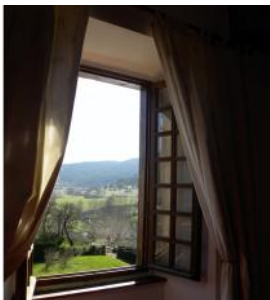
Second floor landing