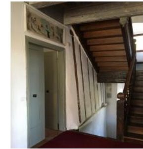
First floor landing