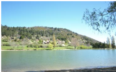
Lake in village