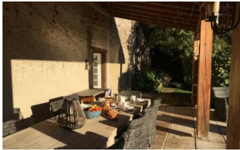
Breakfast on the covered terrace