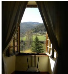
Second floor landing