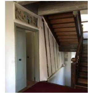
First floor landing