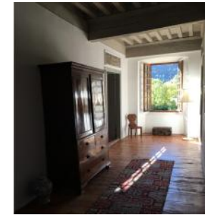
Second floor landing