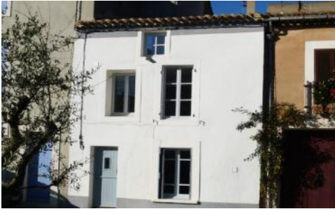
Chez LuLu facade