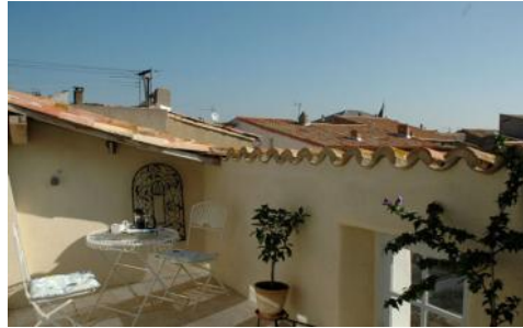
Private roof terrace