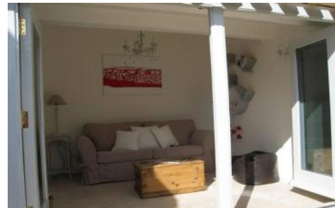
Lounge leading onto Terrace