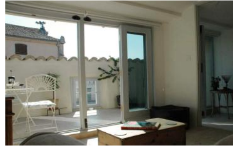
Lounge leading out to terrace