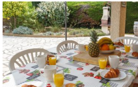
Breakfast on the terrace