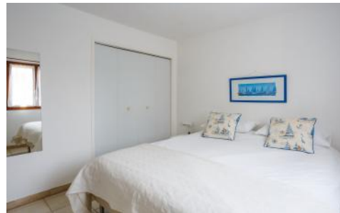
Bedroom 2 as double