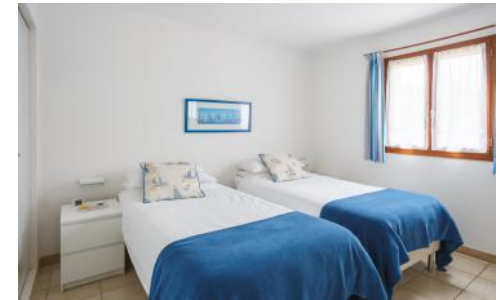
Bedroom 2 as twin