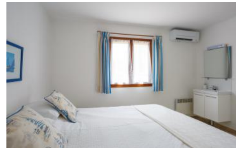
Bedroom 2 with basin