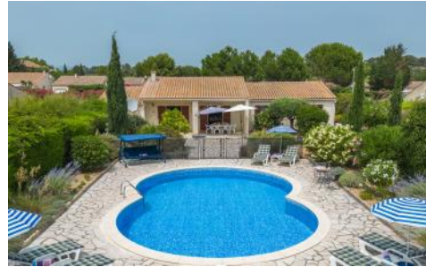
Villa, pool and garden