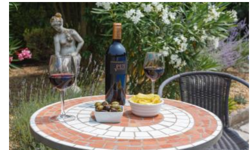
Aperos in the garden