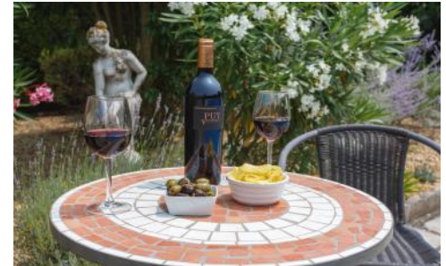
Aperos in the garden