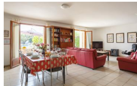
Dining and living area