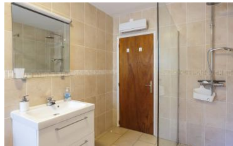
Bathroom with walk in shower