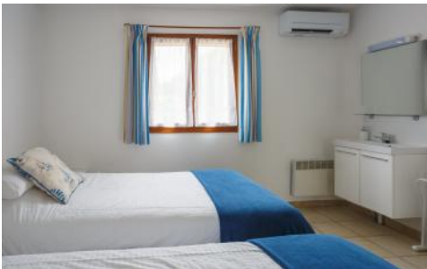
Bedroom 2 as twin