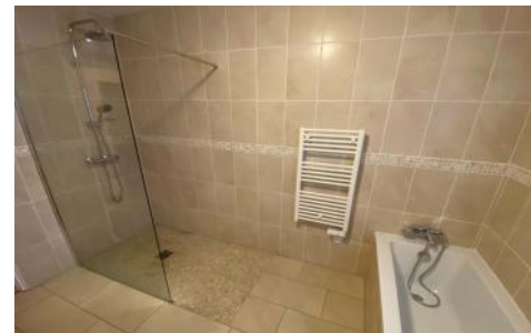
Bathroom with shower and bath