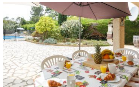
Breakfast on the terrace