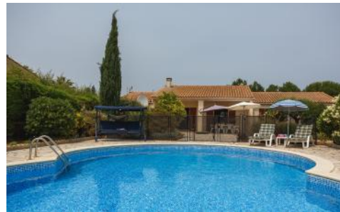
Pool and villa