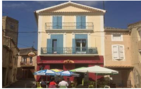
Les trois petits cochons