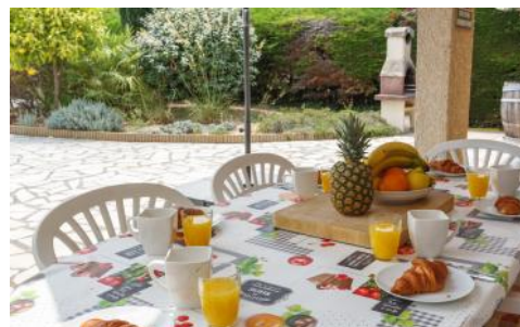
Breakfast on the terrace