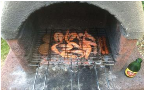
BBQ in the garden