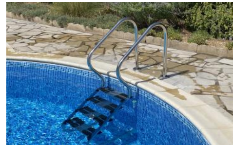
New "comfort" pool steps added 2024