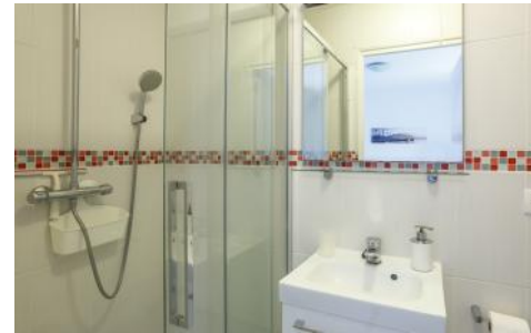
Bedroom 1 En suite