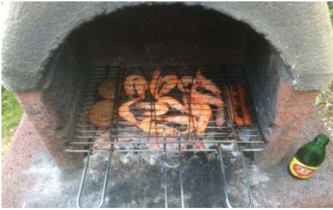
BBQ in the garden