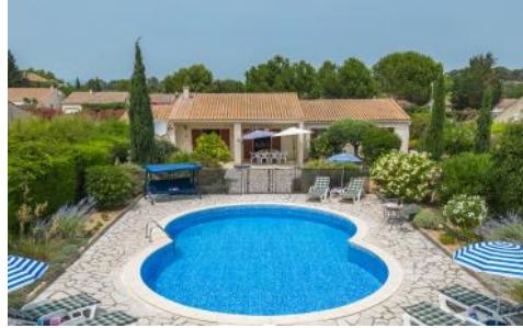
Villa, pool and garden