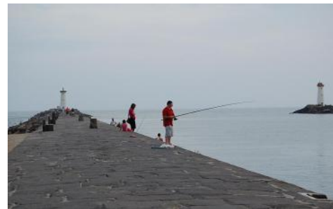
Fishing in Grau d'Agde!