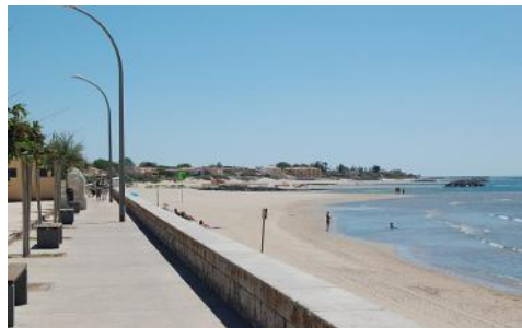
Here is the wonderful beach at Grau d'Agde!