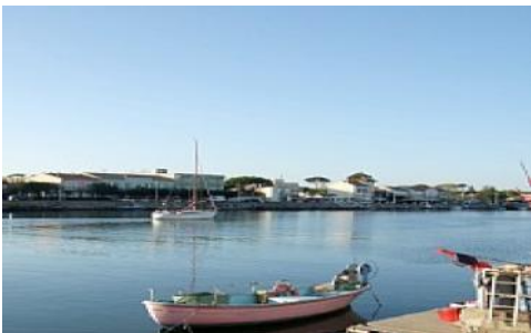
Another view of what you can see every day at Seaview Apartment.