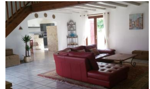
Lounge view 2