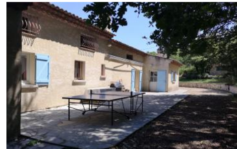
Back of house and cabanon