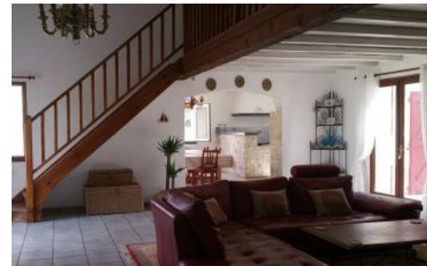
Lounge view 1