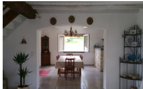
View to dining area