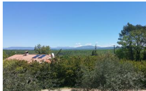
View of Gorges du Verdon