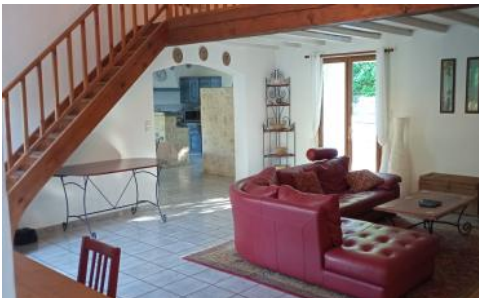
Lounge view 1