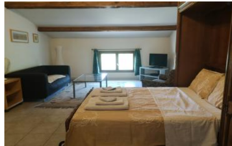
Bedroom 4 view 1