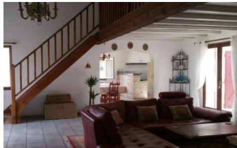
Lounge view 2