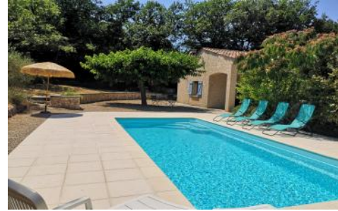
Pool view 1