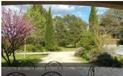
View from terrace