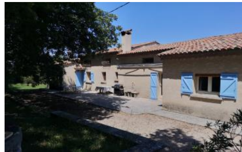
Back of house