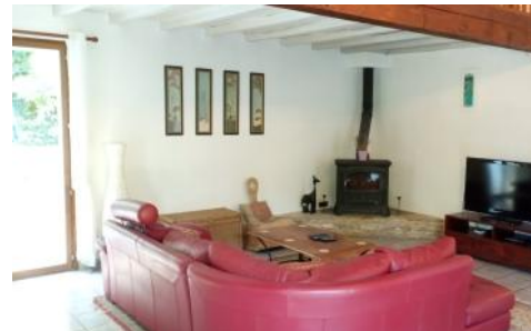
Lounge view 3