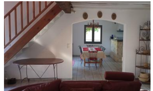
View of dining area