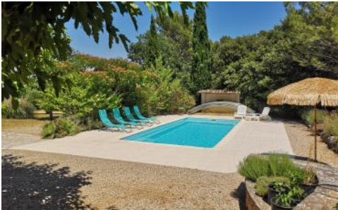
Pool view 3