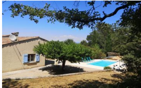
Pool from cabanon