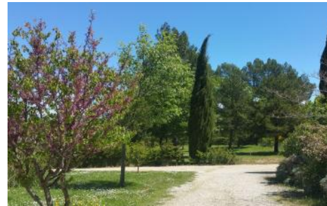
View 2 from terrace