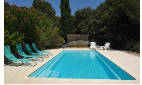
Pool view 2