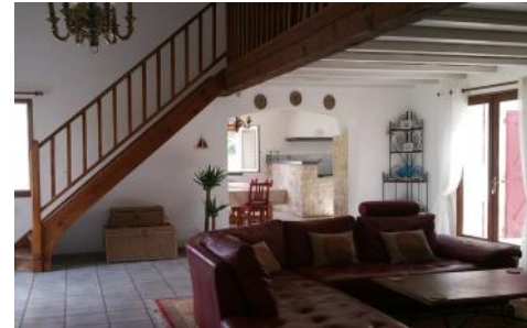
Lounge view 1