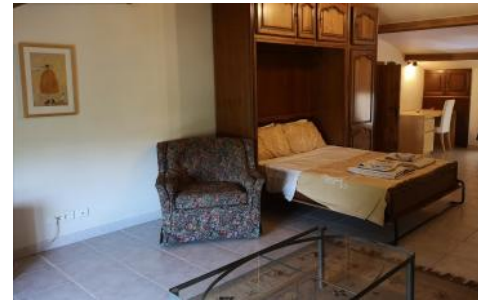
Bedroom 4 view 2