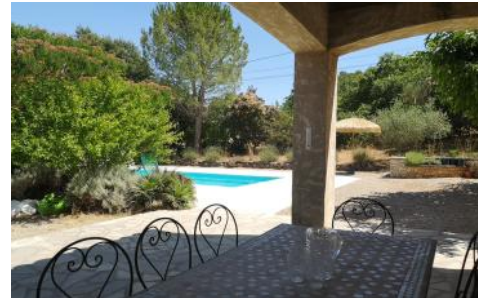
View from terrace 1