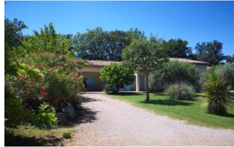
Front of house