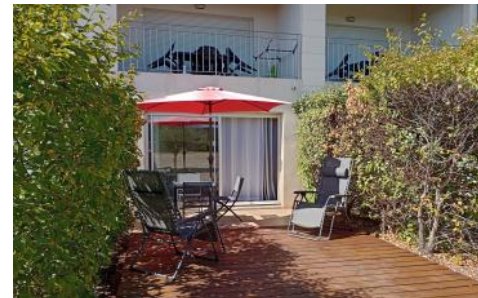
the garden area