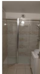
large walk in shower