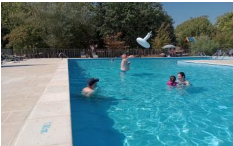
family fun in the pool