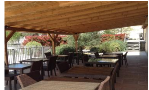
bar area at the residence