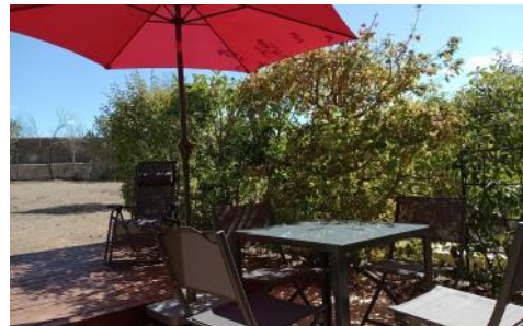
the garden area