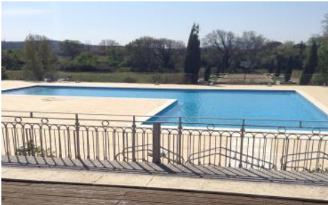
the main pool