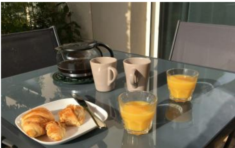
breakfast on the patio