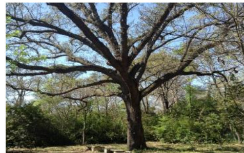
400 year old oak tree