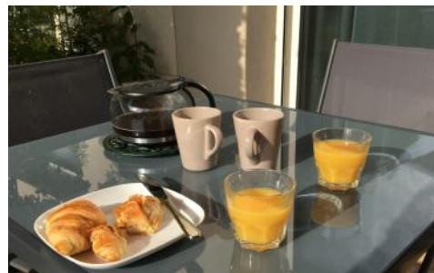
breakfast on the patio