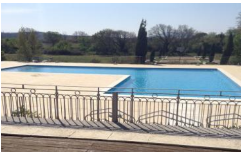
the main pool