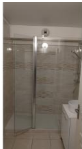
large walk in shower