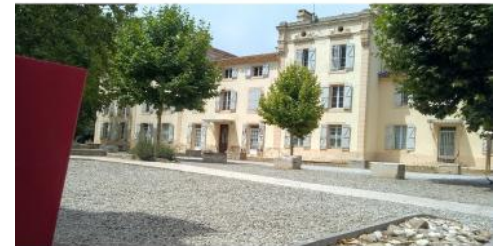
the neighbouring chateau