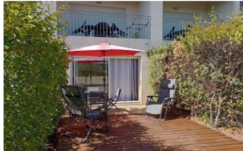
the garden area