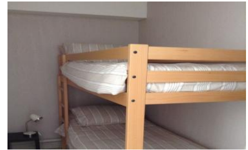
"cabin room" ideal for 5-12 years