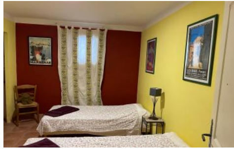
Childrens ensuite bedroom