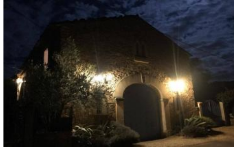
Front lit up at night