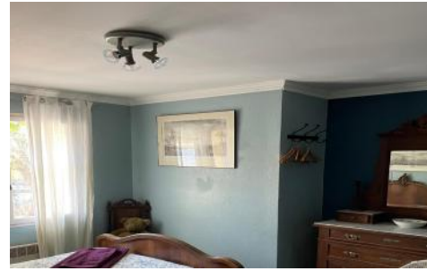
2nd double bedroom