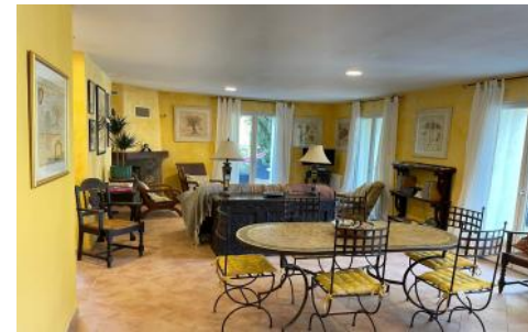
Living room/ diner