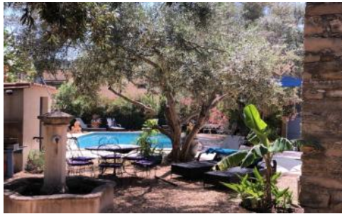
Ancient olive tree