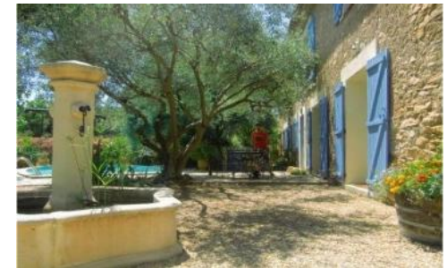
Former water feature, now flower beds