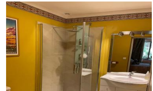
Ensuite shower room