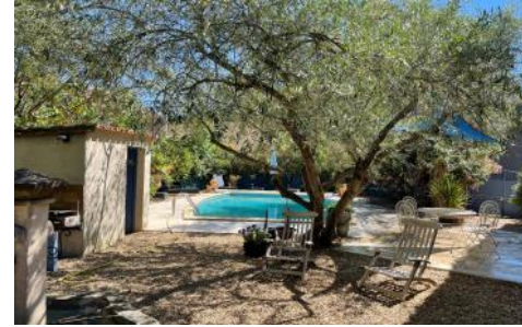
Shaded ancient olive tree