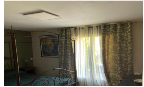
3rd double bedroom