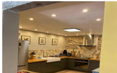
Kitchen off living room