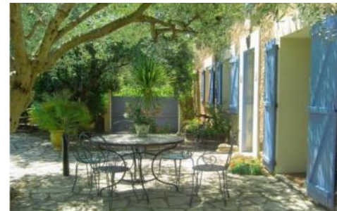
Shaded side terrace