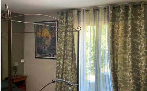
3rd double bedroom