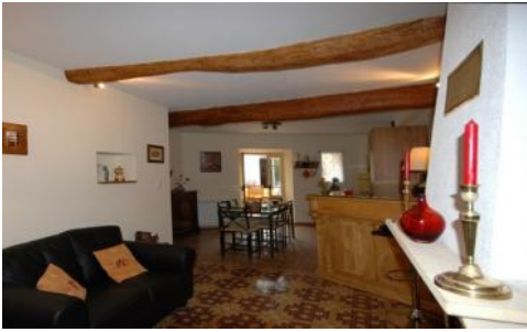
A view of the open lounge and kitchen. You can also see the bar/buffet and a comfy sofa.