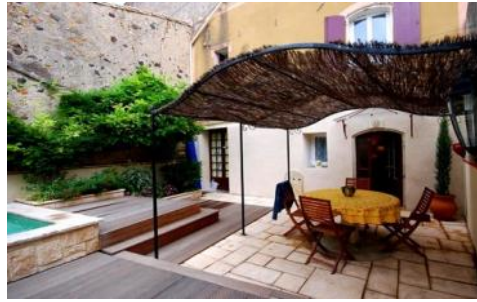
A closer look at the sun awning. It comes in handy to provide shade while you're eating outside.