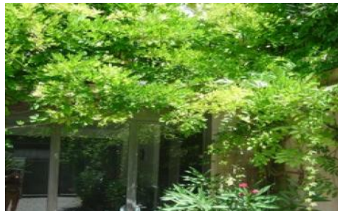
Entrance to the recreation room