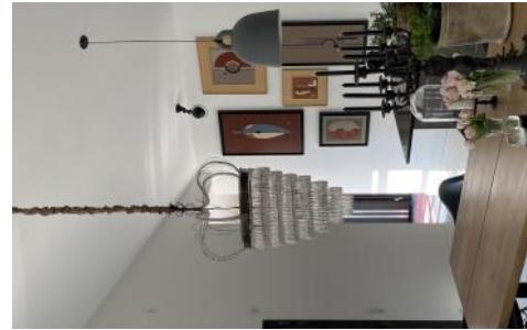
kitchen towards entrance