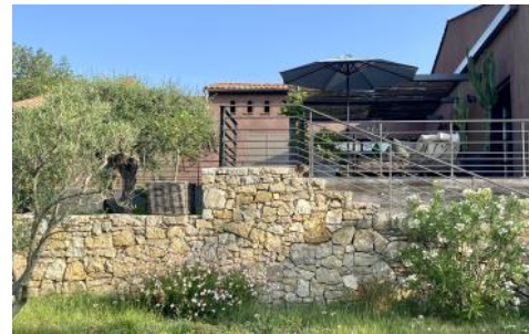
stairs to terrace from garden