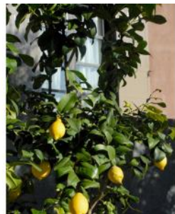
yellow lemon three:)