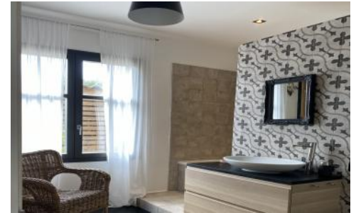
master bedroom ensuite bathroom