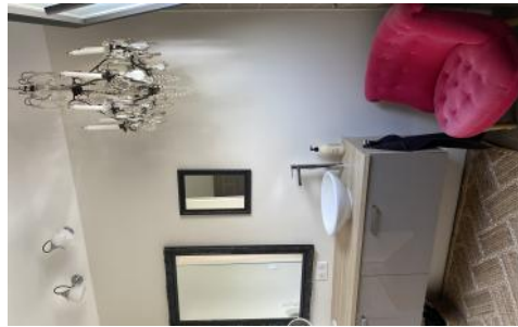
bathroom garden bedroom