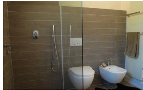
bathroom garden bedroom