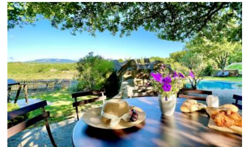
Pool aria breakfast