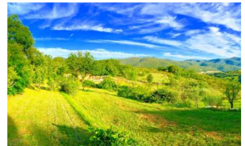
View of land