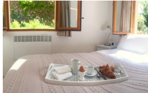
Main house bedroom