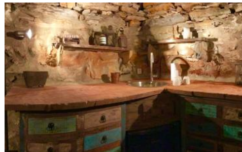
Shepherds hut kitchen