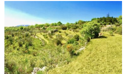
Land to shepherds hut and treehouse