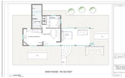
Main house layout