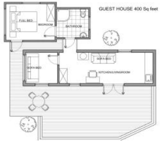
Guest house layout