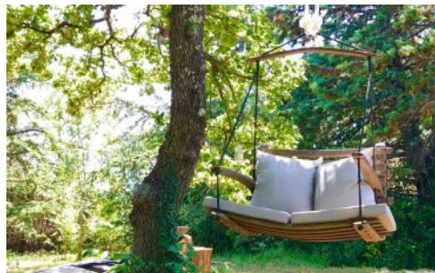
Guest house garden swing