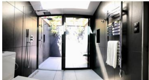
Main house bathroom