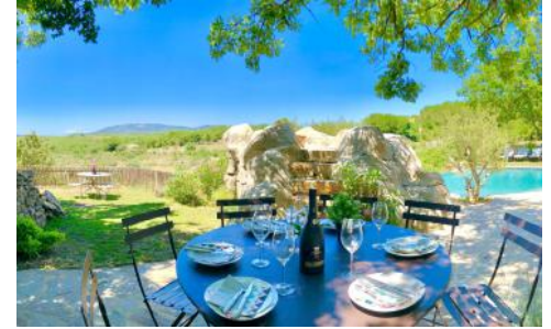
Dinning aria and pool