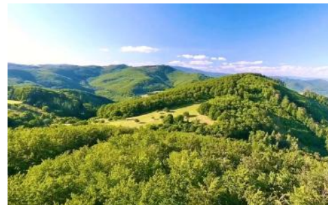
Land from sky