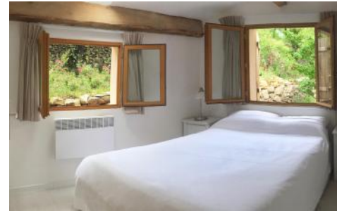
Main house bedroom 2 x single or 1 x double