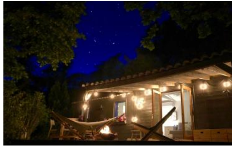
Stars at night guest house