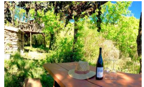
Treehouse dining area