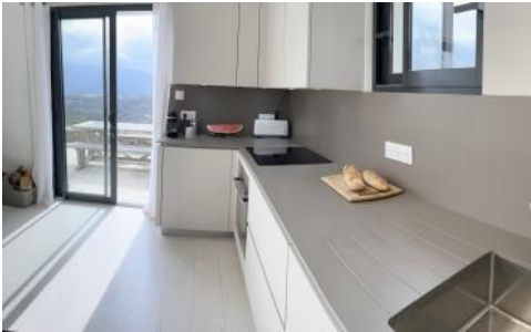
Main house kitchen