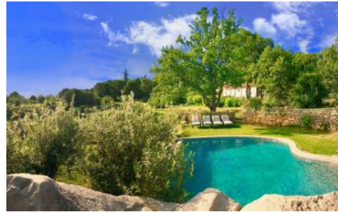
Pool and land