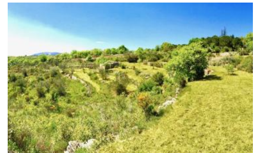
Land to shepherds hutt and treehouse