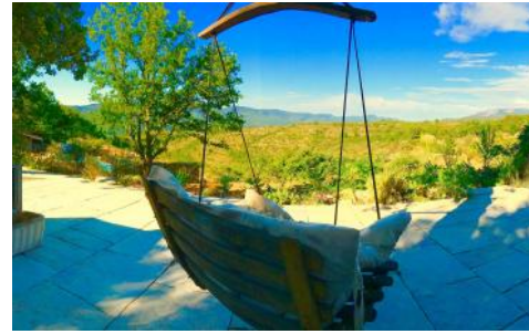
Main house swing chair