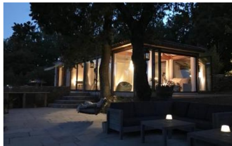
House at night