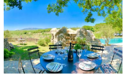
Dinning aria and pool