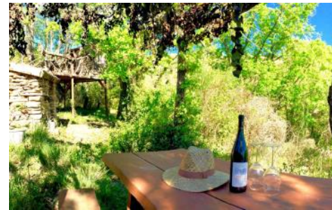
Treehouse dining area