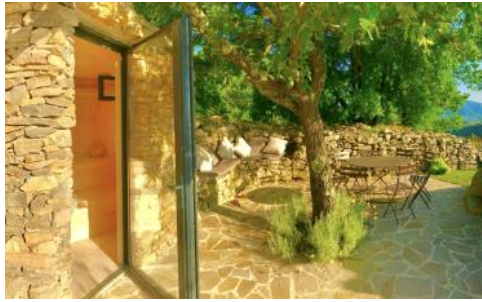
Door to sauna