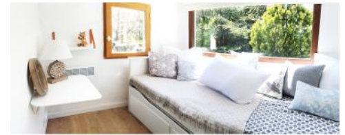
Guest house double fold out bed