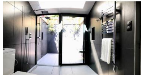
Main house bathroom