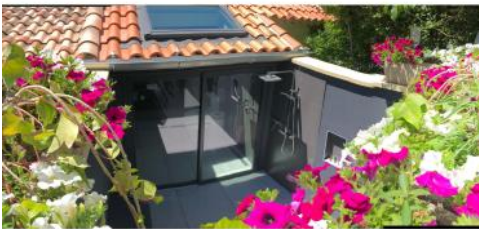
Main house bathroom