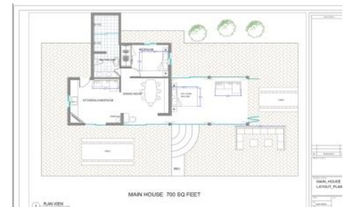
Main house layout