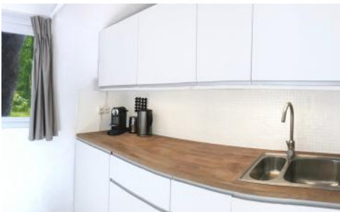
Guest house kitchen