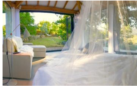
Main house bed