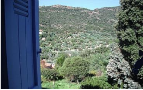
Garden from upstairs