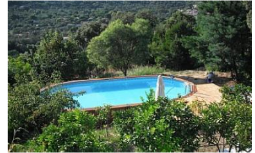
Pool form above