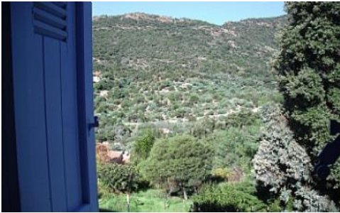
Garden from upstairs