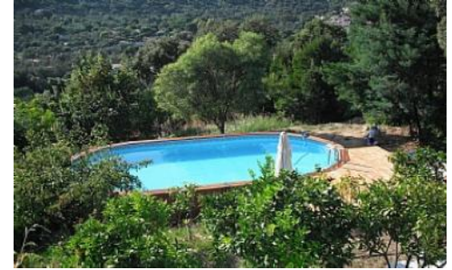
Pool form above