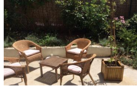
Front seating area