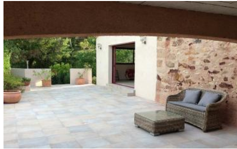
New outdoor area 2013

This is the Vineyard Houses' gorgeous swimming pool. Surrounded by lovely nature, this is the perfect place to lie down and relax by the pool on a hot day in the South of France.