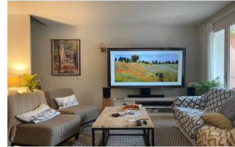
Sitting room and 86 inch TV