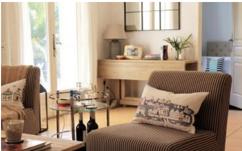
Sitting room and indoor dining table