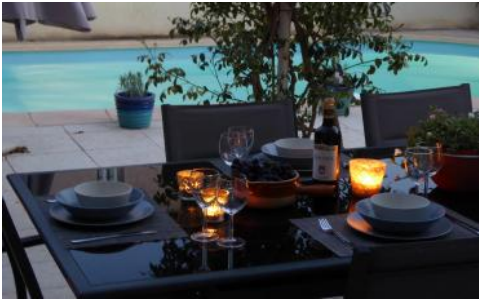
Outside dining table