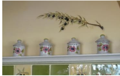
Attention to detail throughout the house