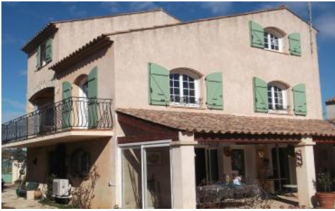
View of Languedocienne house from pool