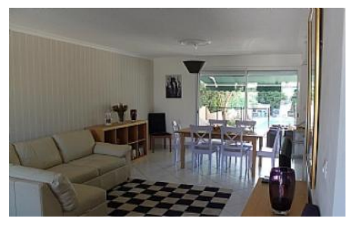
Maison Mima's lounge and dining room are both beautifully decorated with cream sofas, a checkerboard carpet, cable TV, DVD player etc..