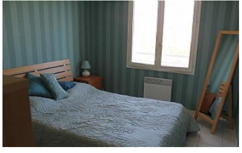
This gorgeous double bedroom in Maison Mima is cosy and spacious with wonderful views from the window.