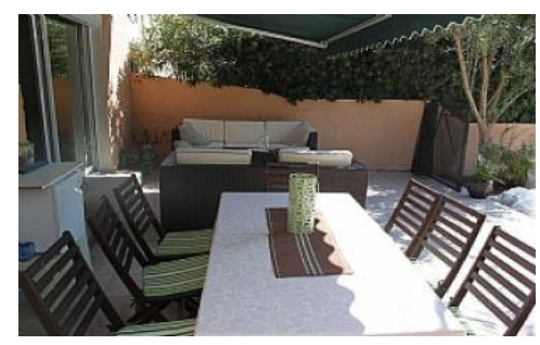
This beautiful terrace at Maison Mima is the perfect place for outdoor dining. It seats 6 people comfortably and overlooks the swimming pool.