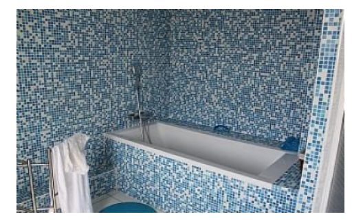
This very originally decorated bathroom in Maison Mima is equipped with a bath, a walk-in shower and 2 basins!