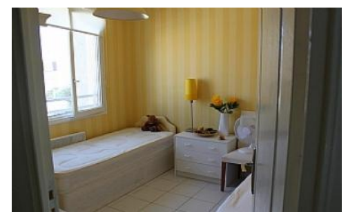
One of the 4 bedrooms in Maison Mima. This bedroom is equipped with twin beds, along with an en-suite shower/sink. Very brightly decorated!