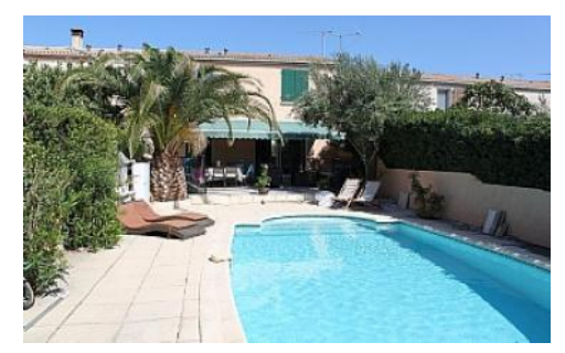
Maison Mima's private swimming pool. It is beautifully located and sees the sun most of the day.