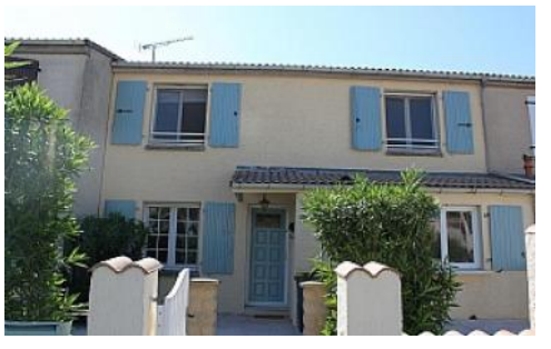
Here is a view of the outside of the Maison Mima. Very cosy and French!