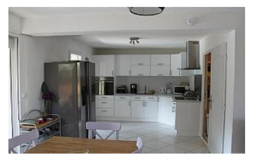
This modern kitchen in Maison Mima is open-plan and fully equipped for your needs!