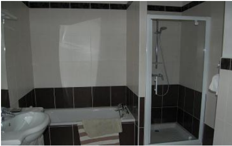
Bath & shower